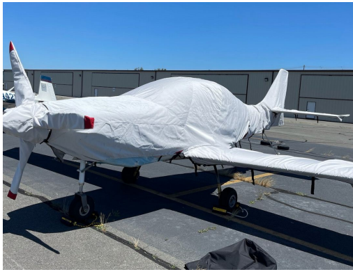
Lancair IV Complete Cover Set