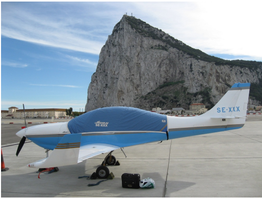
Lancair IV Canopy Cover