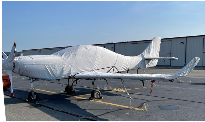
Lancair IV Complete Cover Set