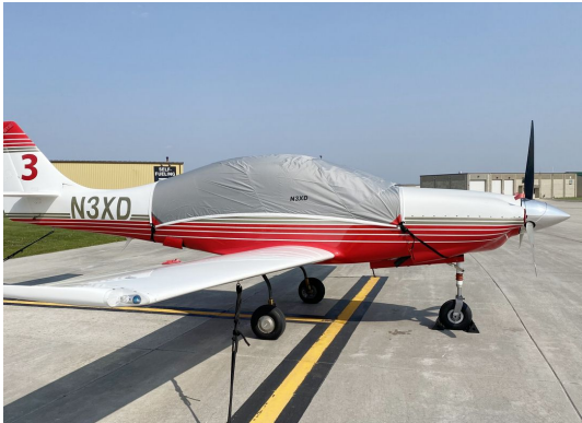
Lancair IV Travel Weight Canopy Cover