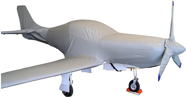
Lancair 320 Complete Fuselage/Wing Cover & Prop Cover

This cover type is made from Silver Acrylic Sunbrella canvas and is 100% lined with a soft and smooth microfiber. Bruce's Custom Covers developed this material combination especially for aircraft protection. The outer material is medium weight and treated for water resistance, UV resistance and anti-static buildup. The inner lining is a very soft and smooth microfiber to prevent scratching. The material is very reflective, and tests show that the cabin interior temperature can be reduced to near-ambient temperature on the hottest of days. It is water, ice and snow repellent, yet breathable to allow moisture to escape from between the cover and the aircraft surface.