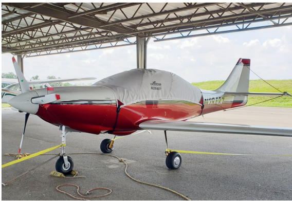
Lancair VI-P Canopy Cover & Engine Plugs

Engine Inlet Plugs are custom fit for your Lancair IV, LX7 intakes, made with heavy-duty vinyl material, and stuffed with a single block of sculpted urethane foam. Each plug has a zipper that allows the foam to be removed and dried if necessary. Engine plugs have warning flags that are visible from the cockpit or 'remove before flight' streamers sewn onto the face of the plugs. Most plugs are imprinted with the aircraft registration number in black for an extra charge. Storage bag NOT included. Engine plugs may be inserted after flight when the engine is still warm. Engine Inlet Plugs are commonly referred to as Cowl Plugs, Intake Plugs, Cowl Blocks, Engine Blocks, and Engine Bungs.