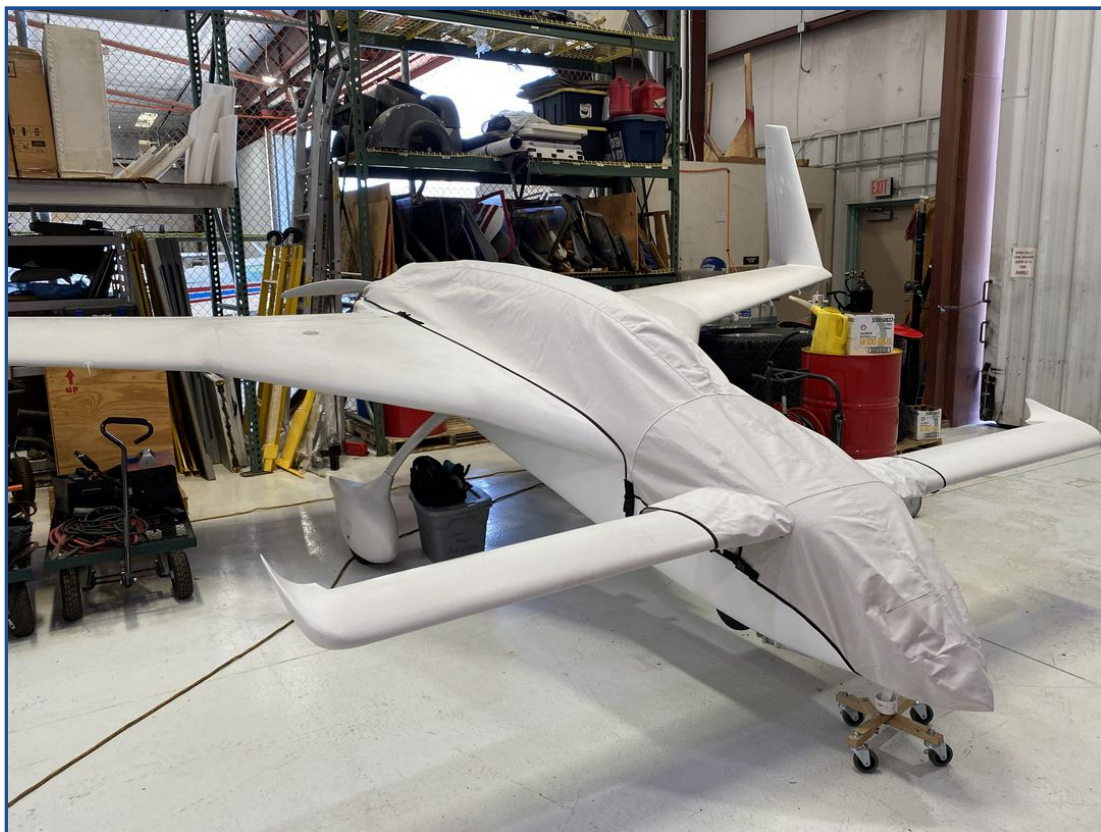
Rutan Long-EZ Canopy/Nose/Engine Cover