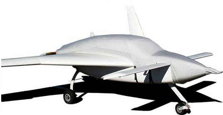
Velocity Canopy/Nose/Engine Cover