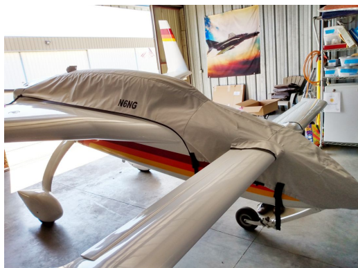
Rutan Long-EZ Canopy/Nose Cover

Travel Covers are made with Silver Solution-Dyed Polyester fabric and only lined over the windshield to save weight. The material is lightweight and more compact for easy stowage in the aircraft. The polyester material is water resistant, but only intended for occasional use outside. We also have an ultra lightweight material available for fitted hangar dust covers. For daily outdoor use, the non-travel Sunbrella Cover is the best choice.