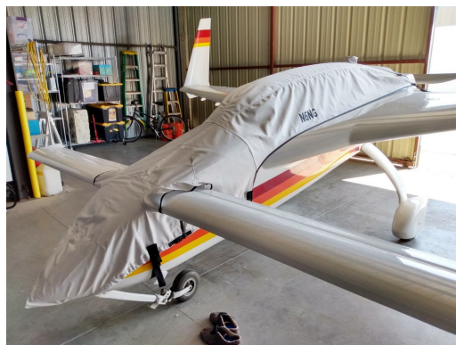
Rutan Long-EZ Canopy/Nose Cover