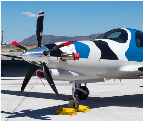
Lancair Evolution Prop Tie/Exhaust Covers, Inlet Plug