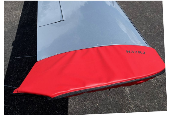
Cirrus SR-22 Wingtip Pads