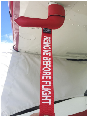
Cessna A185F Pitot Cover

Engine Inlet Plugs are custom fit for your Lancair Evolution intakes, made with heavy-duty vinyl material, and stuffed with a single block of sculpted urethane foam. Each plug has a zipper that allows the foam to be removed and dried if necessary. Engine plugs have warning flags that are visible from the cockpit or 'remove before flight' streamers sewn onto the face of the plugs. Most plugs are imprinted with the aircraft registration number in black for an extra charge. Storage bag NOT included. Engine plugs may be inserted after flight when the engine is still warm. Engine Inlet Plugs are commonly referred to as Cowl Plugs, Intake Plugs, Cowl Blocks, Engine Blocks, and Engine Bungs.