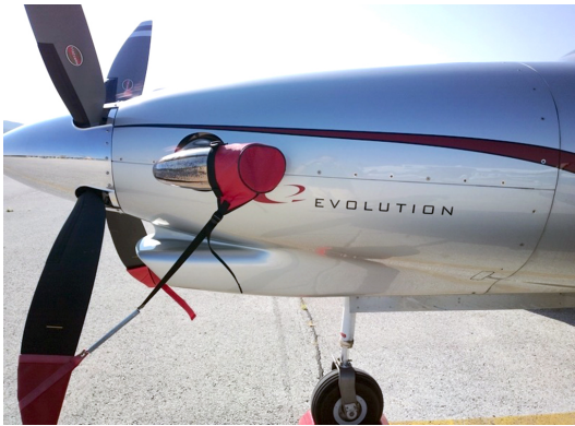
Lancair Evolution Prop Tie/Exhaust Covers

This cover type is made from Silver Acrylic Sunbrella canvas and is 100% lined with a soft and smooth microfiber. Bruce's Custom Covers developed this material combination especially for aircraft protection. The outer material is medium weight and treated for water resistance, UV resistance and anti-static buildup. The inner lining is a very soft and smooth microfiber to prevent scratching. The material is very reflective, and tests show that the cabin interior temperature can be reduced to near-ambient temperature on the hottest of days. It is water, ice and snow repellent, yet breathable to allow moisture to escape from between the cover and the aircraft surface.