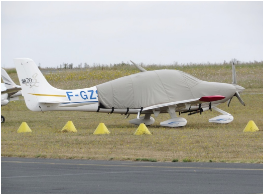
Cirrus SR-22 Extended Canopy/Engine Cover, Prop Cover, Wingtip Pads

Designed to prevent damage to the aircraft extremities in crowded hangars, these products are made of bright red Naugahyde and thickly padded with a sandwich of closed cell foam.