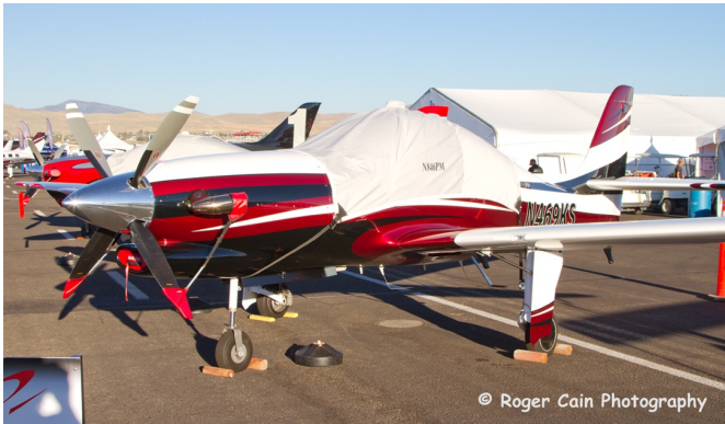
Lancair Evolution Canopy Cover, Prop Tie/Exhaust Covers