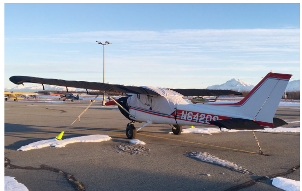
Cessna 172M Canopy, Wings, Horiz. Stab., Insulated Engine & Prop Covers