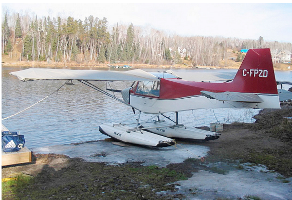
Rans S-7 Insulated Engine Cover, Wing Covers and Horizontal Stabilizer Covers

WINTER USE MATERIAL - Made with Solution-Dyed Polyester fabric, this option is intended for seasonal use to aid in deicing, rain mitigation, or for occasional travel. The material is lighter and more compact, but more susceptible to UV damage and may have a shorter useful life if used continuously outside than the all-year use material.