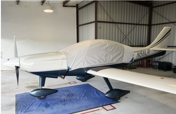
Lancair ES Canopy Cover

This cover type is made from Silver Acrylic Sunbrella canvas and is 100% lined with a soft and smooth microfiber. Bruce's Custom Covers developed this material combination especially for aircraft protection. The outer material is medium weight and treated for water resistance, UV resistance and anti-static buildup. The inner lining is a very soft and smooth microfiber to prevent scratching. The material is very reflective, and tests show that the cabin interior temperature can be reduced to near-ambient temperature on the hottest of days. It is water, ice and snow repellent, yet breathable to allow moisture to escape from between the cover and the aircraft surface.