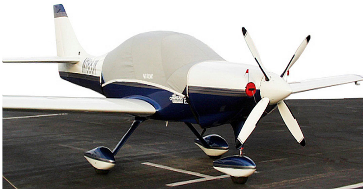
Lancair ES Canopy Cover

Travel Covers are made with Silver Solution-Dyed Polyester fabric and only lined over the windshield to save weight. The material is lightweight and more compact for easy stowage in the aircraft. The polyester material is water resistant, but only intended for occasional use outside. We also have an ultra lightweight material available for fitted hangar dust covers. For daily outdoor use, the non-travel Sunbrella Cover is the best choice.