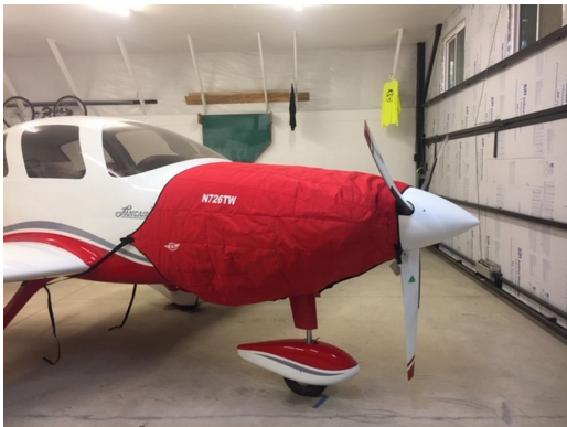
Lancair ES Insulated Engine Cover, Fully Enclosed