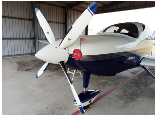
Lancair ES Engine Plugs

Engine Inlet Plugs are custom fit for your Lancair ES intakes, made with heavy-duty vinyl material, and stuffed with a single block of sculpted urethane foam. Each plug has a zipper that allows the foam to be removed and dried if necessary. Engine plugs have warning flags that are visible from the cockpit or 'remove before flight' streamers sewn onto the face of the plugs. Most plugs are imprinted with the aircraft registration number in black for an extra charge. Storage bag NOT included. Engine plugs may be inserted after flight when the engine is still warm. Engine Inlet Plugs are commonly referred to as Cowl Plugs, Intake Plugs, Cowl Blocks, Engine Blocks, and Engine Bungs.