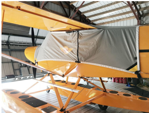
Legend Cub Light Weight Travel Cover

Travel Covers are made with Silver Solution-Dyed Polyester fabric and only lined over the windshield to save weight. The material is lightweight and more compact for easy stowage in the aircraft. The polyester material is water resistant, but only intended for occasional use outside. We also have an ultra lightweight material available for fitted hangar dust covers. For daily outdoor use, the non-travel Sunbrella Cover is the best choice.