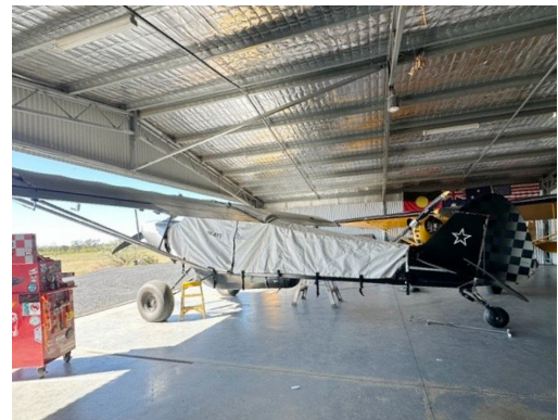
Cub MOAC Extra-Extended Canopy Cover