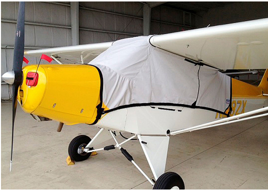
Legend Cub Over-Top Canopy Cover and Engine Plugs