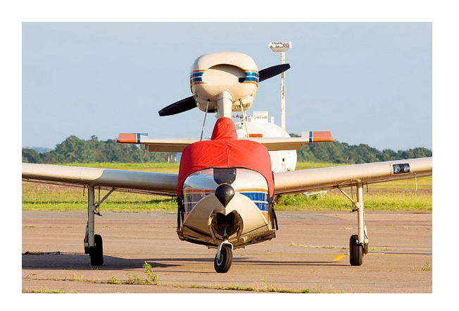
Lake LA-4 Canopy Cover