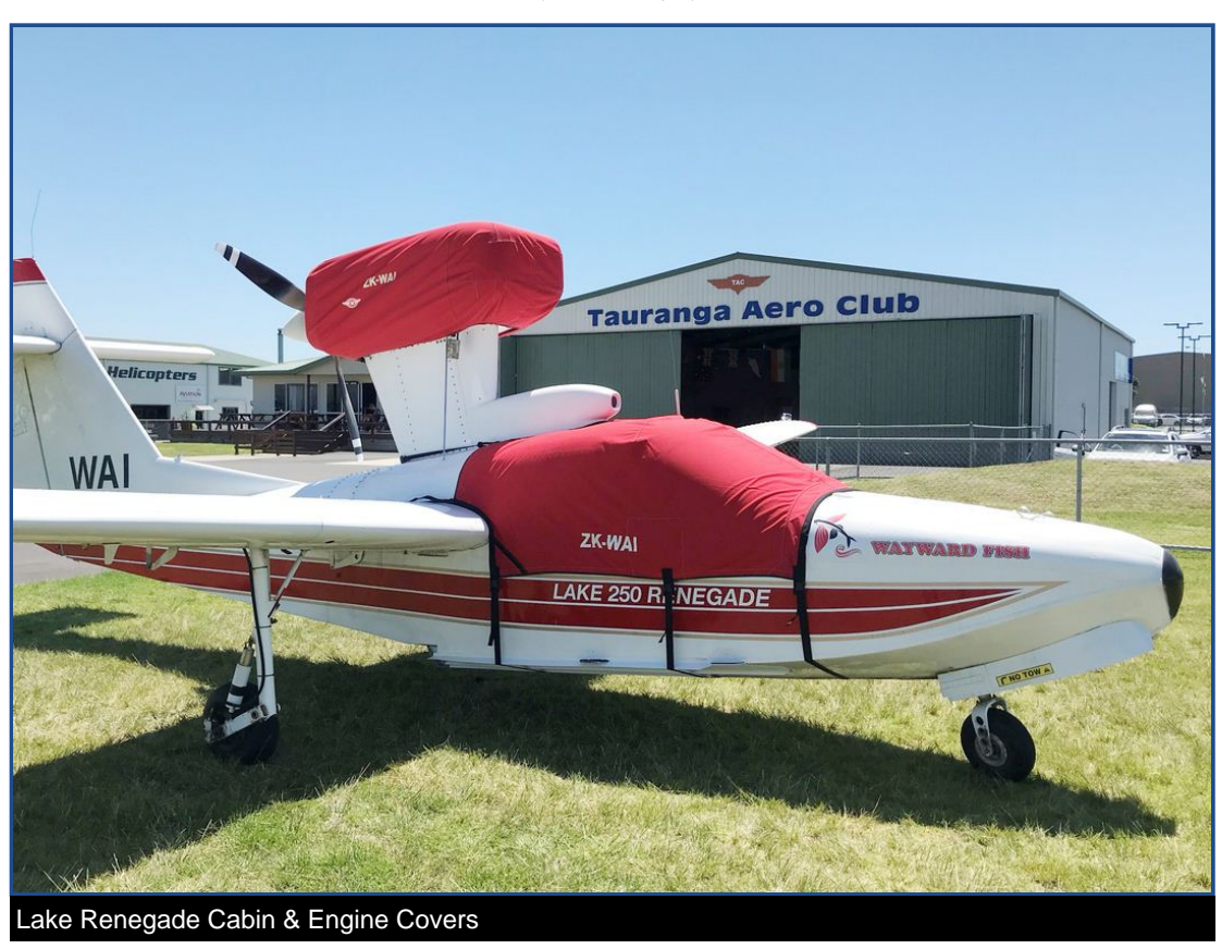
Section 1: Canopy/Cockpit/Fuselage Covers

Canopy Covers help reduce damage to your airplane's upholstery and avionics caused by excessive heat, and they can eliminate problems caused by leaking door and window seals. They keep the windshield and window surfaces clean and help prevent vandalism and theft.