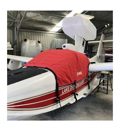
Lake LA250 Renegade Cockpit Cover, Engine Cover (test fit)