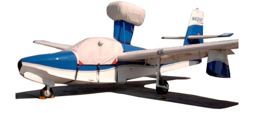
Lake Canopy/Nose Cover (fully enclosed), Engine Cover