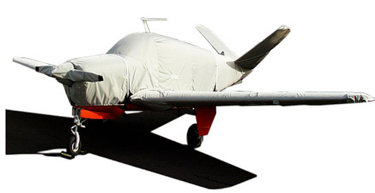
Beech Bonanza Full Cover Set

WINTER USE MATERIAL - Made with Solution-Dyed Polyester fabric, this option is intended for seasonal use to aid in deicing, rain mitigation, or for occasional travel. The material is lighter and more compact, but more susceptible to UV damage and may have a shorter useful life if used continuously outside than the all-year use material.