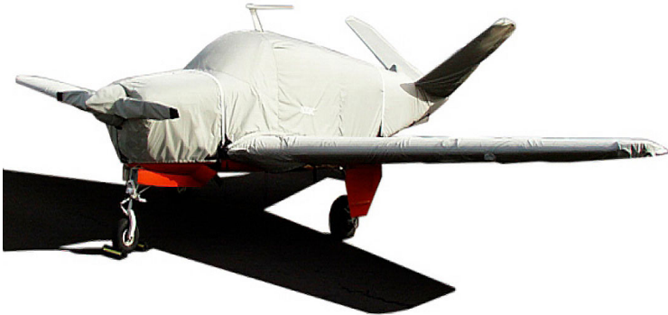
Beech Bonanza Full Cover Set

This cover type is made from Silver Acrylic Sunbrella canvas and is 100% lined with a soft and smooth microfiber. Bruce's Custom Covers developed this material combination especially for aircraft protection. The outer material is medium weight and treated for water resistance, UV resistance and anti-static buildup. The inner lining is a very soft and smooth microfiber to prevent scratching. The material is very reflective, and tests show that the cabin interior temperature can be reduced to near-ambient temperature on the hottest of days. It is water, ice and snow repellent, yet breathable to allow moisture to escape from between the cover and the aircraft surface.