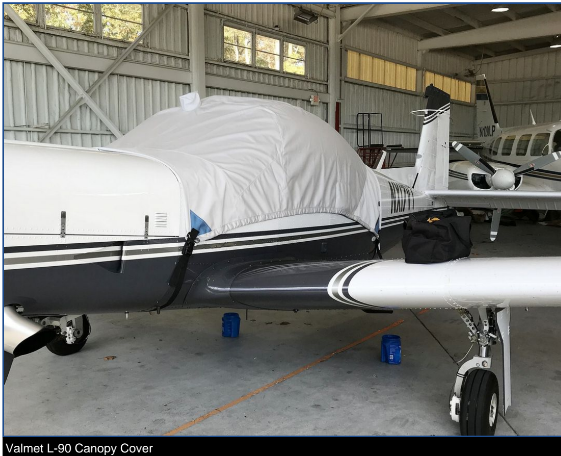
Valmet L-90 Canopy Cover