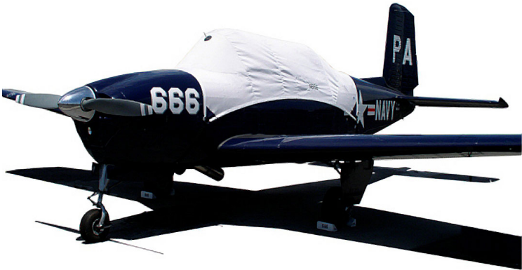
The T34 Canopy Cover