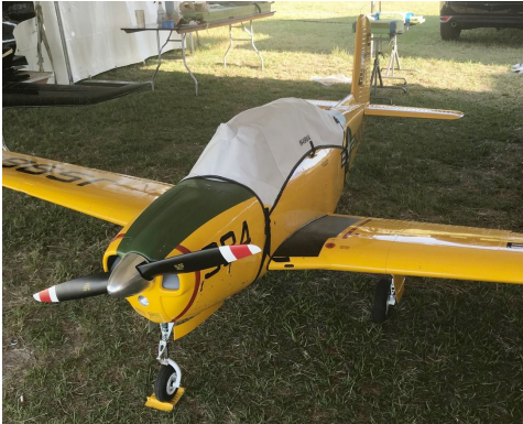
Beechcraft T-34B Mentor Canopy Cover, for 36% Scale Model

Travel Covers are made with Silver Solution-Dyed Polyester fabric and only lined over the windshield to save weight. The material is lightweight and more compact for easy stowage in the aircraft. The polyester material is water resistant, but only intended for occasional use outside. We also have an ultra lightweight material available for fitted hangar dust covers. For daily outdoor use, the non-travel Sunbrella Cover is the best choice.