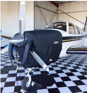
Beech Bonanza 36 Models Insulated Engine Cover