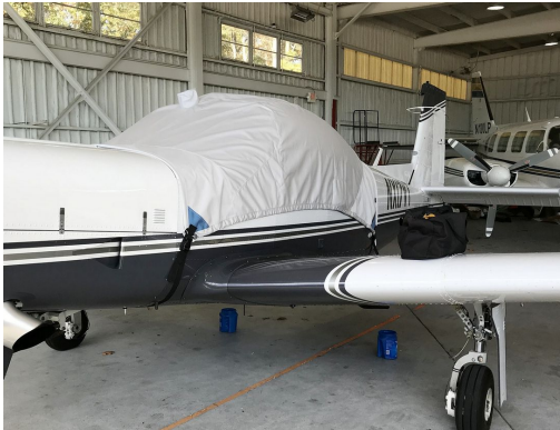
Valmet L-90 Canopy Cover

This cover type is made from Silver Acrylic Sunbrella canvas and is 100% lined with a soft and smooth microfiber. Bruce's Custom Covers developed this material combination especially for aircraft protection. The outer material is medium weight and treated for water resistance, UV resistance and anti-static buildup. The inner lining is a very soft and smooth microfiber to prevent scratching. The material is very reflective, and tests show that the cabin interior temperature can be reduced to near-ambient temperature on the hottest of days. It is water, ice and snow repellent, yet breathable to allow moisture to escape from between the cover and the aircraft surface.