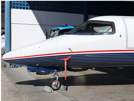
Lear Pitot Cover