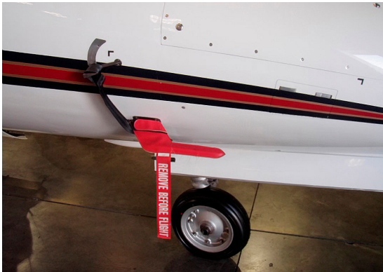
Learjet Heat Resistant Pitot Cover with AOA strap

The Engine Inlet Plugs are custom fit for your Lear 55 intakes, made with heavy-duty vinyl material, and stuffed with a single block of sculpted urethane foam. Each plug has a zipper that allows the foam to be removed and dried if necessary. Engine plugs have 'remove before flight' streamers sewn onto the face of the plugs. Most plugs are imprinted with the aircraft registration number in black for an extra charge. Storage bag NOT included. Engine plugs may be inserted after flight when the engine is still warm. Engine Inlet Plugs are commonly referred to as Cowl Plugs, Intake Plugs, Cowl Blocks, Engine Blocks, and Engine Bungs.