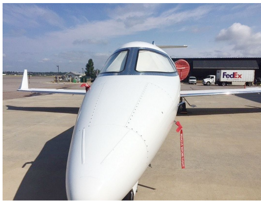
Lear Models 40 & 45 Cockpit Heatshields, Covers All Cockpit Windows