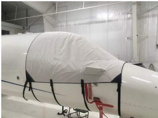
Lear 45 Cockpit Cover

This cover type is made from Silver Acrylic Sunbrella canvas and is 100% lined with a soft and smooth microfiber. Bruce's Custom Covers developed this material combination especially for aircraft protection. The outer material is medium weight and treated for water resistance, UV resistance and anti-static buildup. The inner lining is a very soft and smooth microfiber to prevent scratching. The material is very reflective, and tests show that the cabin interior temperature can be reduced to near-ambient temperature on the hottest of days. It is water, ice and snow repellent, yet breathable to allow moisture to escape from between the cover and the aircraft surface.