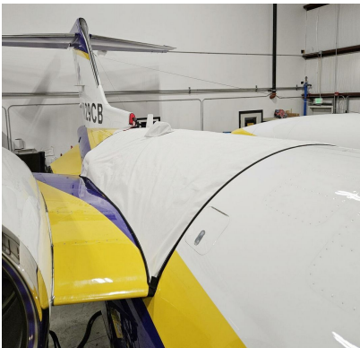
Lear 45 Empennage Saddle Cover W/ Dorsal Inlet Plug (Covers Upper Fuselage Between Pylons, Acm/Apu Area) Lear 45 Empennage Saddle Cover W/ Dorsal Inlet Plug (Covers Upper Fuselage Between Pylons, Acm/Apu Area)