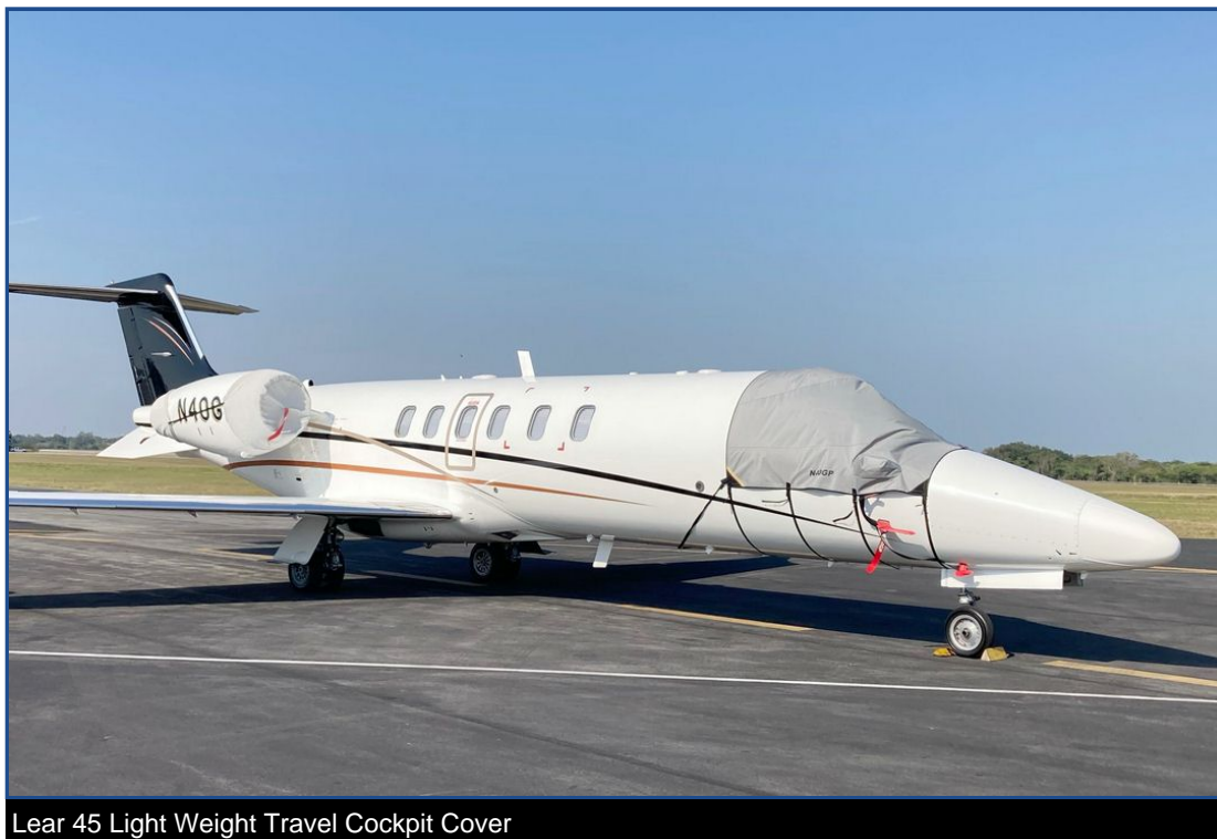
Lear 45 Light Weight Travel Cockpit Cover