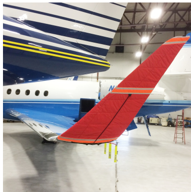
Falcon 2000 Winglet Pad