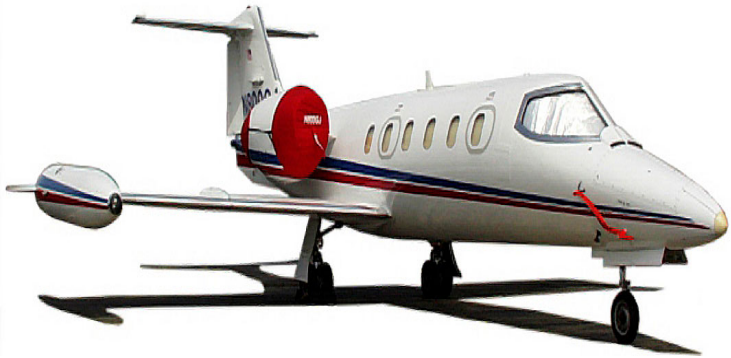
Lear 35 Engine Covers, Pitot Covers & Cockpit HeatShields

The Lear Models 40 & 45 Bikini Style Engine Covers are a single-piece design using a soft and smooth stretchy and fabric. The cover stretches tightly over both the intake and exhaust, installing quickly and easily. These covers are designed to be used as hangar dust covers and have a useful life of approximately one year.