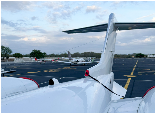
Lear 45 Dorsal Plug