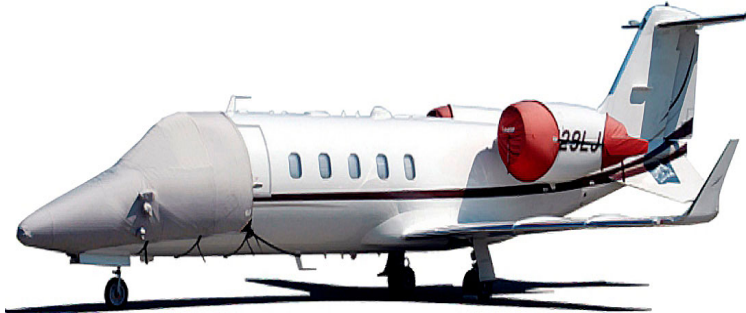
Lear 45 Windshield/Nose & Engine Cover Set