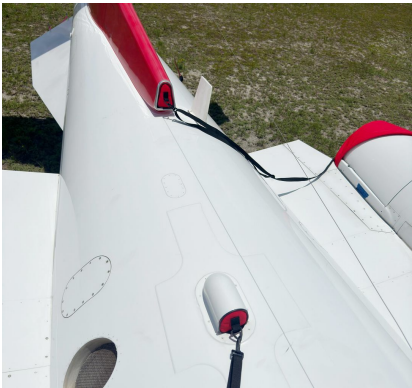
Lear 45 Dorsal, ACM & Fuel Vent Inlet Plugs

The Engine Inlet Plugs are custom fit for your Lear Models 40 & 45 intakes, made with heavy-duty vinyl material, and stuffed with a single block of sculpted urethane foam. Each plug has a zipper that allows the foam to be removed and dried if necessary. Engine plugs have 'remove before flight' streamers sewn onto the face of the plugs. Most plugs are imprinted with the aircraft registration number in black for an extra charge. Storage bag NOT included. Engine plugs may be inserted after flight when the engine is still warm. Engine Inlet Plugs are commonly referred to as Cowl Plugs, Intake Plugs, Cowl Blocks, Engine Blocks, and Engine Bungs.