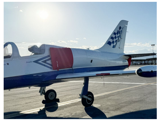
Aero L-39 & L-59 Albatros Intake Covers