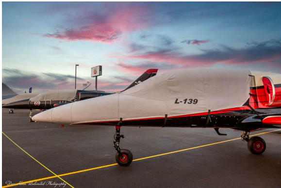
Aero L39 Canopy/Nose Cover