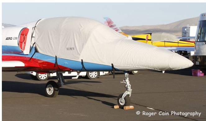
Aero L-39 Canopy/Nose Cover, Engine Plugs