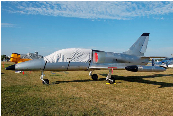
Aero L39 Canopy Cover

This cover type is made from Silver Acrylic Sunbrella canvas and is 100% lined with a soft and smooth microfiber. Bruce's Custom Covers developed this material combination especially for aircraft protection. The outer material is medium weight and treated for water resistance, UV resistance and anti-static buildup. The inner lining is a very soft and smooth microfiber to prevent scratching. The material is very reflective, and tests show that the cabin interior temperature can be reduced to near-ambient temperature on the hottest of days. It is water, ice and snow repellent, yet breathable to allow moisture to escape from between the cover and the aircraft surface.