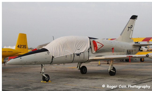
Aero L-39 Canopy Cover, Engine Plugs