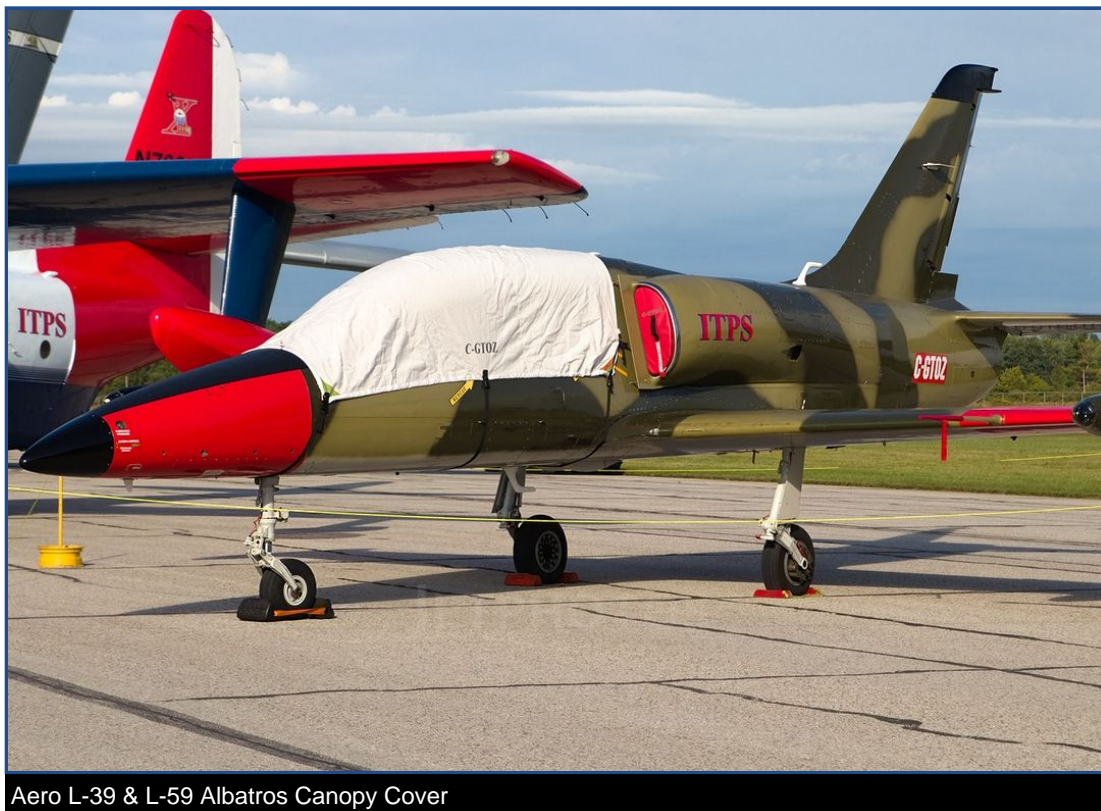
Aero L-39 &amp; L-59 Albatros Canopy Cover