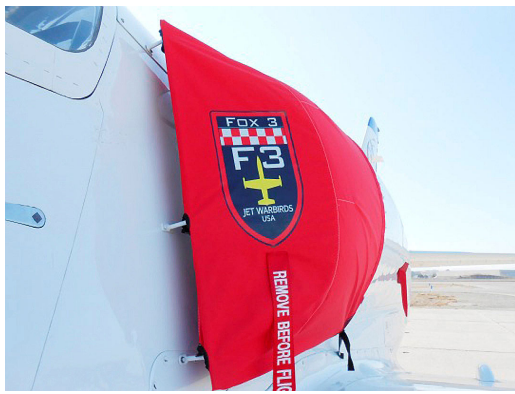
Aero L-39 Engine Covers, Snap-On Type