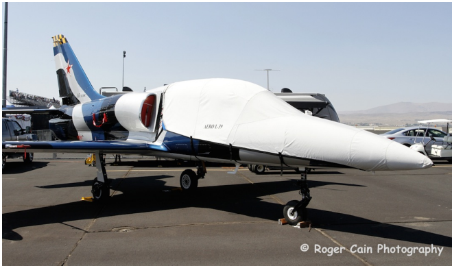
Aero L-39 Canopy/Nose Cover, Engine Plugs