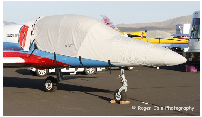
Aero L-39 Canopy/Nose Cover, Engine Plugs