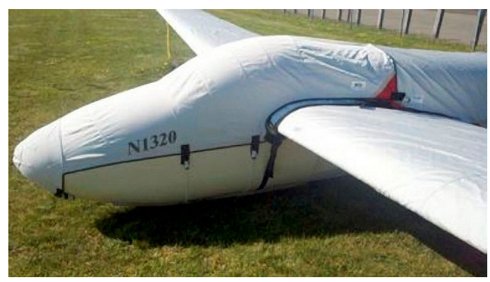
Schweizer SGS 1-26B Canopy/Nose, Wings & Empennage Covers