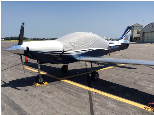
Lancair IV Light Weight Travel Canopy Cover

This cover type is made from Silver Acrylic Sunbrella canvas and is 100% lined with a soft and smooth microfiber. Bruce's Custom Covers developed this material combination especially for aircraft protection. The outer material is medium weight and treated for water resistance, UV resistance and anti-static buildup. The inner lining is a very soft and smooth microfiber to prevent scratching. The material is very reflective, and tests show that the cabin interior temperature can be reduced to near-ambient temperature on the hottest of days. It is water, ice and snow repellent, yet breathable to allow moisture to escape from between the cover and the aircraft surface.