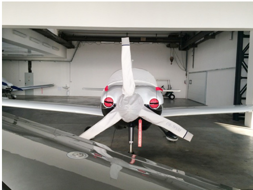
Cessna 350/400 Engine Inlet Plugs, 3-Blade Prop Cover