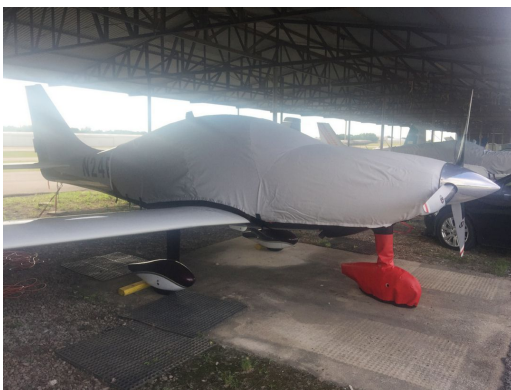
Lancair Columbia Extended Canopy/Engine Cover, Nose Wheelpant Cover

ALL-YEAR USE MATERIAL - Made with Silver Acrylic Sunbrella canvas, the all-year use material is the best option for sun protection and cover longevity. This heavier more durable material is intended for all weather conditions, such as rain and snow or lots of sun.