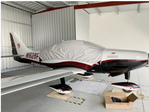
Corvalis TT 400 Canopy Cover