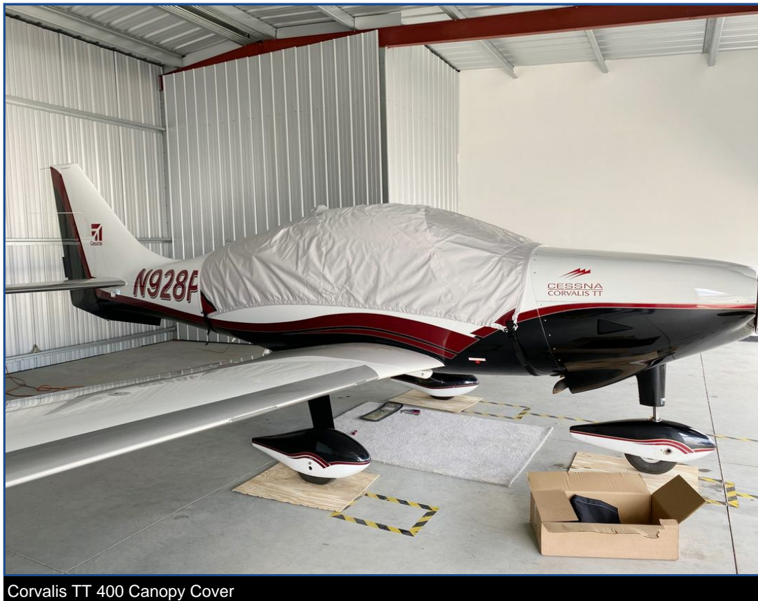
Corvalis TT 400 Canopy Cover