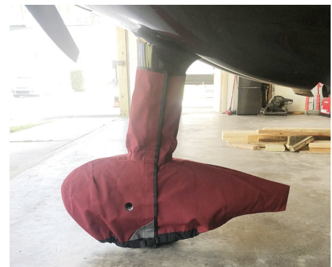
Cessna Corvalis, Lancair Columbia Wheelpant & Strut Cover