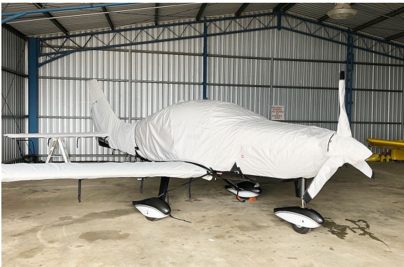
Columbia 350 Full Cover Set