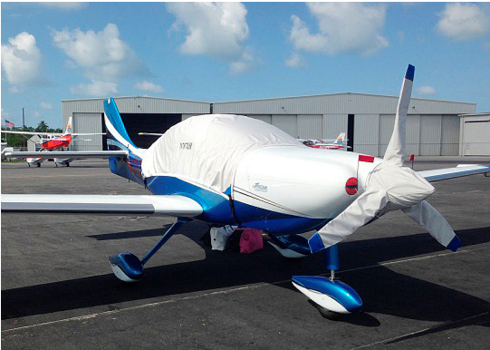
Propellor/Spinner Cover, 3-Blade

This cover type is made from Silver Acrylic Sunbrella canvas and is 100% lined with a soft and smooth microfiber. Bruce's Custom Covers developed this material combination especially for aircraft protection. The outer material is medium weight and treated for water resistance, UV resistance and anti-static buildup. The inner lining is a very soft and smooth microfiber to prevent scratching. The material is very reflective, and tests show that the cabin interior temperature can be reduced to near-ambient temperature on the hottest of days. It is water, ice and snow repellent, yet breathable to allow moisture to escape from between the cover and the aircraft surface.