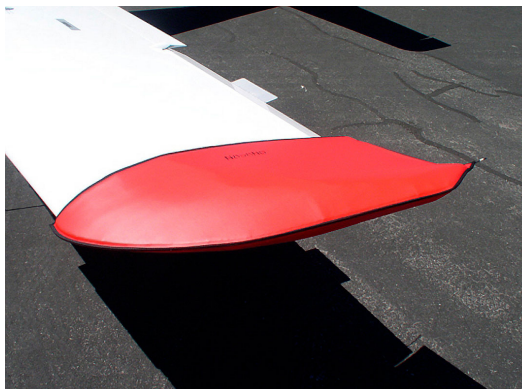
Cessna 350/400 Wingtip Pads

Designed to prevent damage to the aircraft extremities in crowded hangars, these products are made of bright red Naugahyde and thickly padded with a sandwich of closed cell foam.