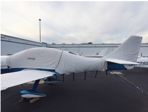
Lancair ES Wing Covers & Empennage Cover (sold separately)

WINTER USE MATERIAL - Made with Solution-Dyed Polyester fabric, this option is intended for seasonal use to aid in deicing, rain mitigation, or for occasional travel. The material is lighter and more compact, but more susceptible to UV damage and may have a shorter useful life if used continuously outside than the all-year use material.