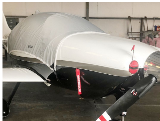
Columbia 350 Travel Cover, Engine Plugs