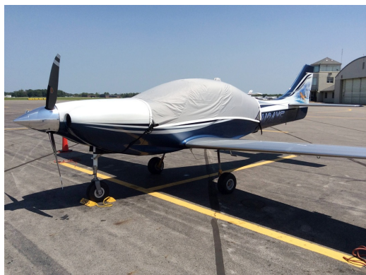
Lancair IV Light Weight Travel Canopy Cover

Travel Covers are made with Silver Solution-Dyed Polyester fabric and only lined over the windshield to save weight. The material is lightweight and more compact for easy stowage in the aircraft. The polyester material is water resistant, but only intended for occasional use outside. We also have an ultra lightweight material available for fitted hangar dust covers. For daily outdoor use, the non-travel Sunbrella Cover is the best choice.