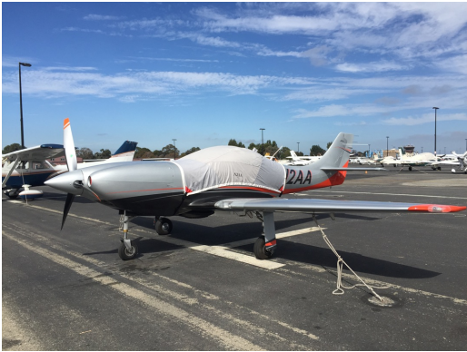
Lancair Legacy 2000 Travel Canopy Cover