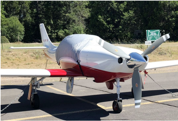
Lancair Legacy 2000 Travel Cover, Light Weight Travel Canopy Cover

occasional use outside. We also have an ultra lightweight material available for fitted hangar dust covers. For daily outdoor use, the non-travel Sunbrella Cover is the best choice.