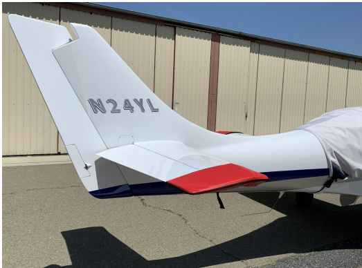
Lancair Legacy 2000 Wingtip & Horiz. Stab. Pads