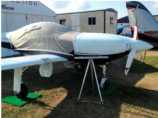
Lancair Legacy Canopy Cover

This cover type is made from Silver Acrylic Sunbrella canvas and is 100% lined with a soft and smooth microfiber. Bruce's Custom Covers developed this material combination especially for aircraft protection. The outer material is medium weight and treated for water resistance, UV resistance and anti-static buildup. The inner lining is a very soft and smooth microfiber to prevent scratching. The material is very reflective, and tests show that the cabin interior temperature can be reduced to near-ambient temperature on the hottest of days. It is water, ice and snow repellent, yet breathable to allow moisture to escape from between the cover and the aircraft surface.