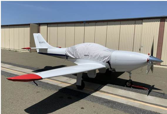
Lancair Legacy 2000 Wingtip & Horiz. Stab. Pads

Designed to prevent damage to the aircraft extremities in crowded hangars, these products are made of bright red Naugahyde and thickly padded with a sandwich of closed cell foam.