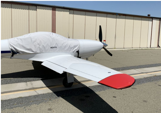
Lancair Legacy 2000 Wingtip & Horiz. Stab. Pads