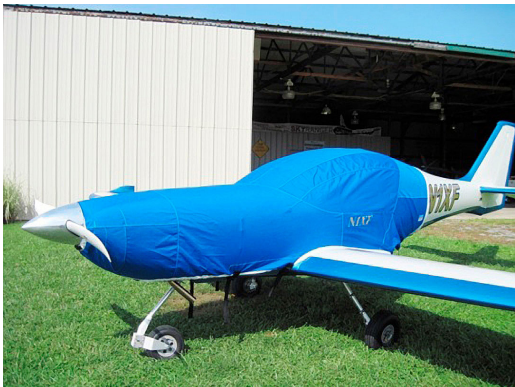
Arion Lightning Extended Canopy/Engine Cover