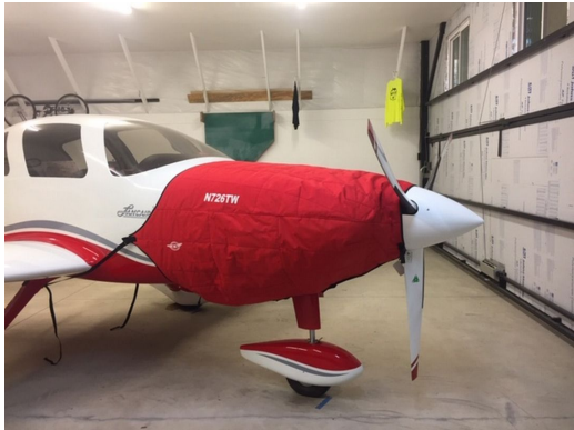
Lancair Insulated Engine Covers, fully and partially enclosed, 3D models Lancair ES Insulated Engine Cover, Fully Enclosed