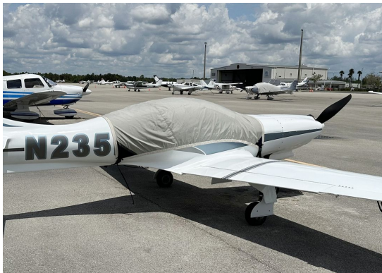
Lancair 235 Canopy Cover

Travel Covers are made with Silver Solution-Dyed Polyester fabric and only lined over the windshield to save weight. The material is lightweight and more compact for easy stowage in the aircraft. The polyester material is water resistant, but only intended for occasional use outside. We also have an ultra lightweight material available for fitted hangar dust covers. For daily outdoor use, the non-travel Sunbrella Cover is the best choice.