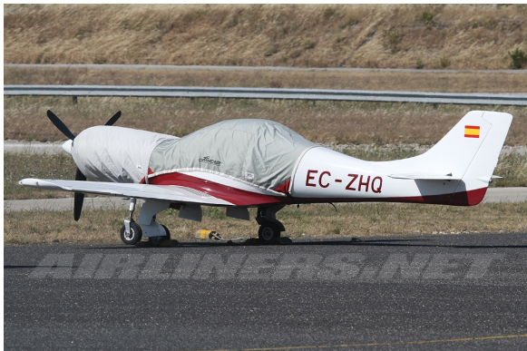
Lancair 360 Canopy Cover, Engine Cover

This cover type is made from Silver Acrylic Sunbrella canvas and is 100% lined with a soft and smooth microfiber. Bruce's Custom Covers developed this material combination especially for aircraft protection. The outer material is medium weight and treated for water resistance, UV resistance and anti-static buildup. The inner lining is a very soft and smooth microfiber to prevent scratching. The material is very reflective, and tests show that the cabin interior temperature can be reduced to near-ambient temperature on the hottest of days. It is water, ice and snow repellent, yet breathable to allow moisture to escape from between the cover and the aircraft surface.