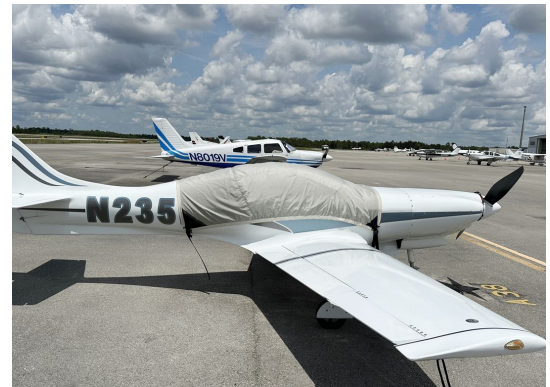
Lancair 235 Canopy Cover