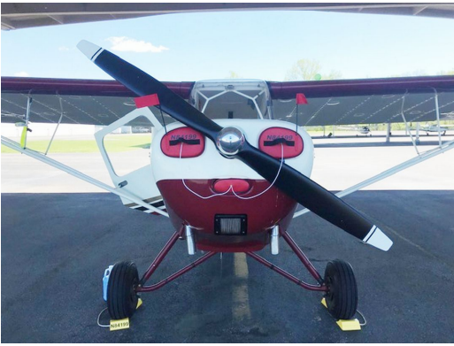
Aeronca Champ 7AC, 7EC Engine Inlet Plugs