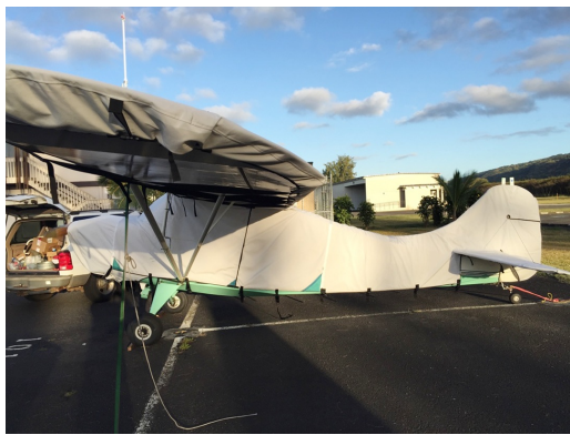
Aeronca 7AC Full Cover Set