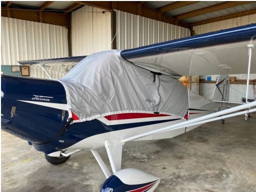
Aeronca Champ Travel Weight Canopy Cover

This cover type is made from Silver Acrylic Sunbrella canvas and is 100% lined with a soft and smooth microfiber. Bruce's Custom Covers developed this material combination especially for aircraft protection. The outer material is medium weight and treated for water resistance, UV resistance and anti-static buildup. The inner lining is a very soft and smooth microfiber to prevent scratching. The material is very reflective, and tests show that the cabin interior temperature can be reduced to near-ambient temperature on the hottest of days. It is water, ice and snow repellent, yet breathable to allow moisture to escape from between the cover and the aircraft surface.