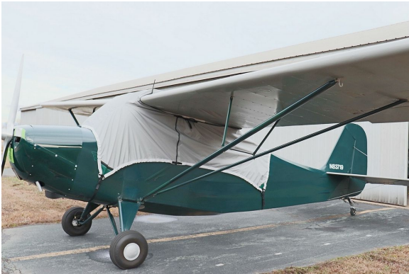
Aeronca 7AC Over-Top Canopy Cover, Light Weight Travel Type