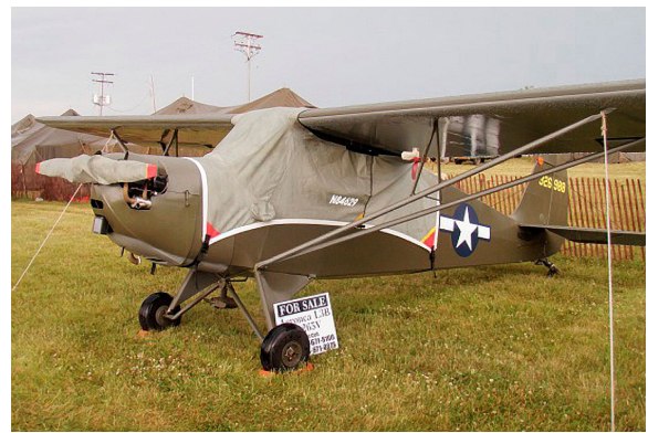
Aeronca 7AC Champ Canopy & Prop Covers