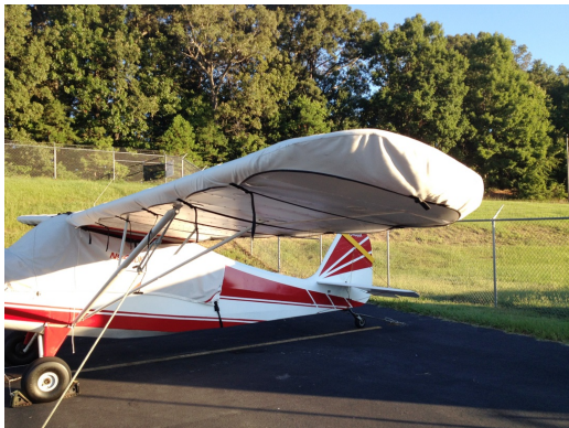
Aeronca Champ Wing Covers, Canopy Cover

WINTER USE MATERIAL - Made with Solution-Dyed Polyester fabric, this option is intended for seasonal use to aid in deicing, rain mitigation, or for occasional travel. The material is lighter and more compact, but more susceptible to UV damage and may have a shorter useful life if used continuously outside than the all-year use material.