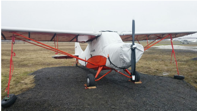
Aeronca Champ 7EC Canopy, Engine, Wing & Empennage Covers

This cover type is made from Silver Acrylic Sunbrella canvas and is 100% lined with a soft and smooth microfiber. Bruce's Custom Covers developed this material combination especially for aircraft protection. The outer material is medium weight and treated for water resistance, UV resistance and anti-static buildup. The inner lining is a very soft and smooth microfiber to prevent scratching. The material is very reflective, and tests show that the cabin interior temperature can be reduced to near-ambient temperature on the hottest of days. It is water, ice and snow repellent, yet breathable to allow moisture to escape from between the cover and the aircraft surface.