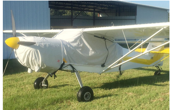
Kitfox Canopy & Engine Cover