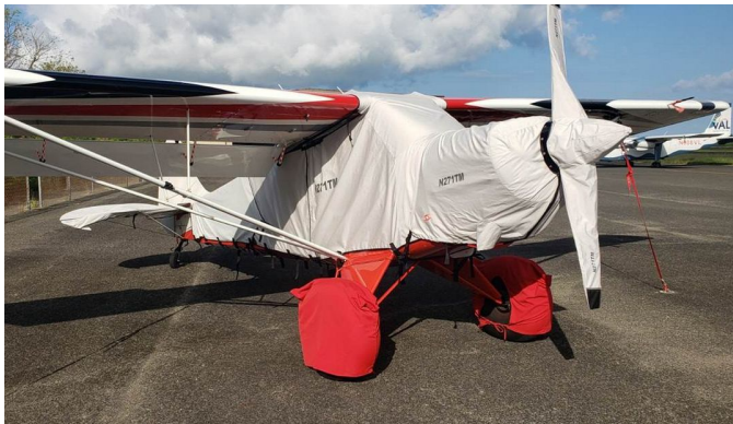
Aviat Husky Extended Canopy Cover, Engine, Prop, Empennage & Tire Covers

ALL-YEAR USE MATERIAL - Made with Silver Acrylic Sunbrella canvas, the all-year use material is the best option for sun protection and cover longevity. This heavier more durable material is intended for all weather conditions, such as rain and snow or lots of sun.