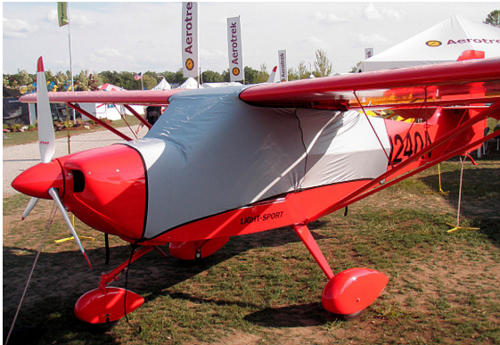
Aerotrek A240 Spandex FlyAway Travel Canopy Cover

This cover type is made from Silver Acrylic Sunbrella canvas and is 100% lined with a soft and smooth microfiber. Bruce's Custom Covers developed this material combination especially for aircraft protection. The outer material is medium weight and treated for water resistance, UV resistance and anti-static buildup. The inner lining is a very soft and smooth microfiber to prevent scratching. The material is very reflective, and tests show that the cabin interior temperature can be reduced to near-ambient temperature on the hottest of days. It is water, ice and snow repellent, yet breathable to allow moisture to escape from between the cover and the aircraft surface.