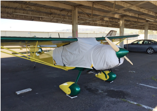
Kitfox Canopy & Engine Covers

Travel Covers are made with Silver Solution-Dyed Polyester fabric and only lined over the windshield to save weight. The material is lightweight and more compact for easy stowage in the aircraft. The polyester material is water resistant, but only intended for occasional use outside. We also have an ultra lightweight material available for fitted hangar dust covers. For daily outdoor use, the non-travel Sunbrella Cover is the best choice.