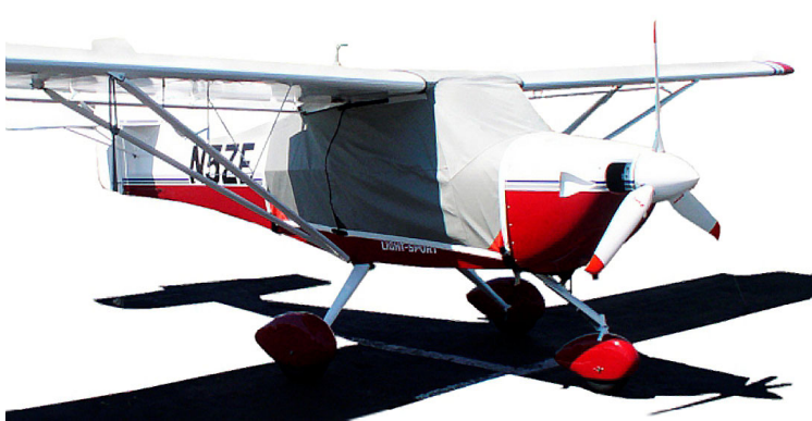
Aerotrek A240 Standard Canopy Cover