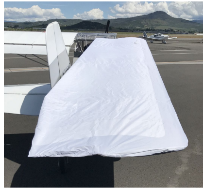
Kitfox Wing Covers, Folded Wing Type, test fit cover