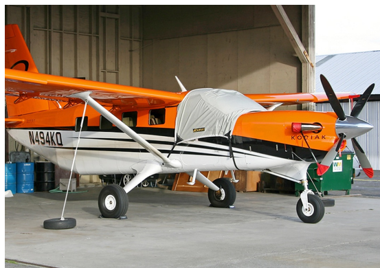
Quest Kodiak Windshield Cover, Prop Tie/Exhaust Covers, Engine Inlet Plugs & Pitot Cover