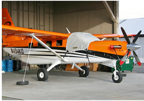
Quest Kodiak Windshield Cover, Prop Tie/Exhaust Covers, Engine Inlet Plugs & Pitot Cover