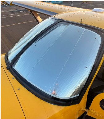
Quest Kodiak Windshield HeatShields