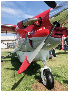
Quest Kodiak Prop Tie/Exhaust Covers, Engine Plug

water resistance, UV resistance and anti-static buildup. The inner lining is a very soft and smooth microfiber to prevent scratching. The material is very reflective, and tests show that the cabin interior temperature can be reduced to near-ambient temperature on the hottest of days. It is water, ice and snow repellent, yet breathable to allow moisture to escape from between the cover and the aircraft surface.