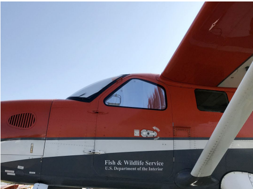
Quest Kodiak Cockpit HeatShields

Cockpit Heatshields are interior sunshades for the aircraft's cockpit. The product is a unique composite of closed-cell foam with a silver mylar finish. The semi-rigid design is stiff enough to stand inside the window framing. The set folds up flat and is easily stored in the included storage sleeve. Some designs may require velcro and suction cups. A Heatshield is an excellent short-term remedy for cockpit overheating, but an external fabric cover is more effective for long-term protection.