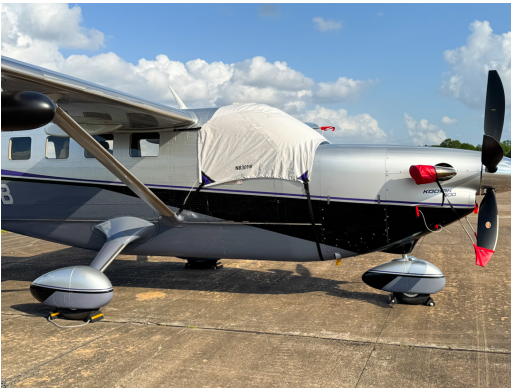
Kodiak Aircraft Co Inc KODIAK 200 Cockpit Cover