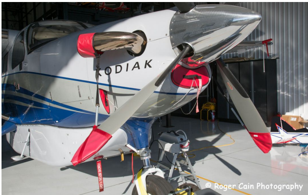
Quest Kodiak Engine Plugs, Prop Tie-Down & Exhaust Covers