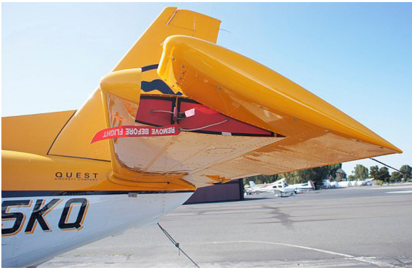
Quest Kodiak Windshield Cover, Prop Tie/Exhaust Covers, Engine Inlet Plugs & Pitot Cover