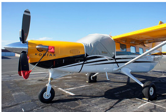
Quest Kodiak Cockpit Cover, Engine Plugs, Prop Tie/Exhaust Covers, & Cabin HeatShields set

This cover type is made from Silver Acrylic Sunbrella canvas and is 100% lined with a soft and smooth microfiber. Bruce's Custom Covers developed this material combination especially for aircraft protection. The outer material is medium weight and treated for water resistance, UV resistance and anti-static buildup. The inner lining is a very soft and smooth microfiber to prevent scratching. The material is very reflective, and tests show that the cabin interior temperature can be reduced to near-ambient temperature on the hottest of days. It is water, ice and snow repellent, yet breathable to allow moisture to escape from between the cover and the aircraft surface.