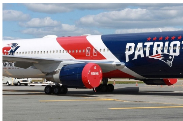
Boeing 767 Intake Covers