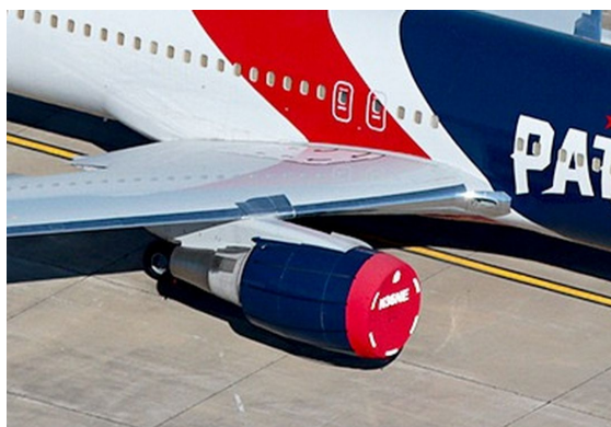
Boeing 767 Intake Covers