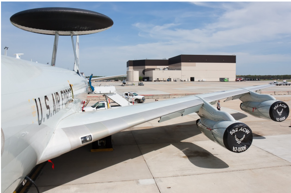
Boeing E-3C Engine Covers

The Engine Inlet Plugs are custom fit for your Boeing KC-135, C-135, RC-135, EC-135 intakes, made with heavy-duty vinyl material, and stuffed with a single block of sculpted urethane foam. Each plug has a zipper that allows the foam to be removed and dried if necessary. Engine plugs have 'remove before flight' streamers sewn onto the face of the plugs. Most plugs are imprinted with the aircraft registration number in black for an extra charge. Storage bag NOT included. Engine plugs may be inserted after flight when the engine is still warm. Engine Inlet Plugs are commonly referred to as Cowl Plugs, Intake Plugs, Cowl Blocks, Engine Blocks, and Engine Bungs.