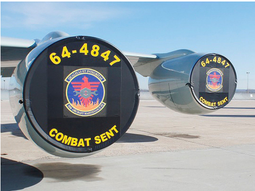
BOEING KC-135 Tambourine Type Double Fold Intake Covers, Custom Mesh Insert & IUID's with custom Imprint KC-135 Intake Covers for the 55th ARW, Offutt AFB