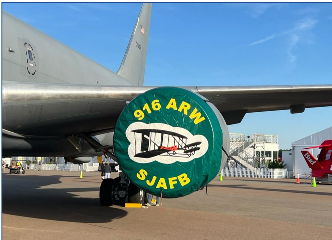
Boeing KC-135 Intake Covers, soft type, CFM56 engines