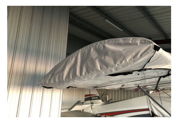
Just JA30 SuperSTOL Cover Set