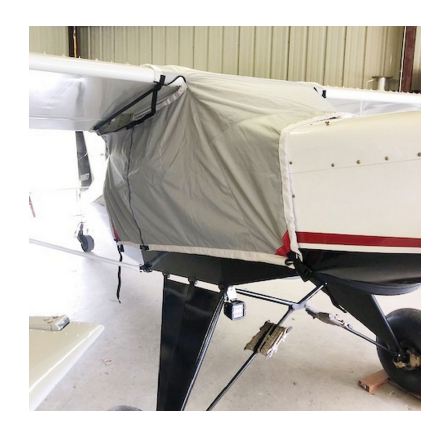
Just Highlander Canopy Cover, Travel Type

This cover type is made from Silver Acrylic Sunbrella canvas and is 100% lined with a soft and smooth microfiber. Bruce's Custom Covers developed this material combination especially for aircraft protection. The outer material is medium weight and treated for water resistance, UV resistance and anti-static buildup. The inner lining is a very soft and smooth microfiber to prevent scratching. The material is very reflective, and tests show that the cabin interior temperature can be reduced to near-ambient temperature on the hottest of days. It is water, ice and snow repellent, yet breathable to allow moisture to escape from between the cover and the aircraft surface.