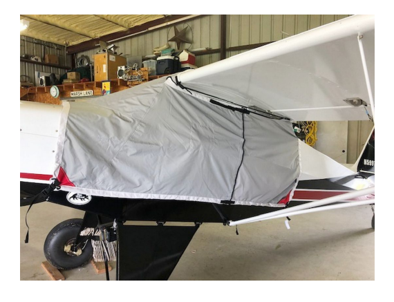
Just Highlander Canopy Cover, Travel Type