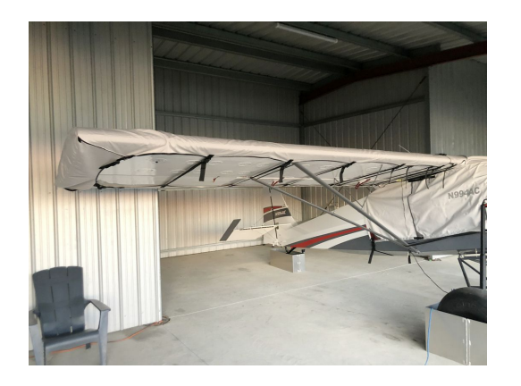
Just JA30 SuperSTOL Cover Set