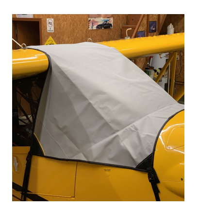
Cub Crafters Carbon Cub FX3 Windshield/Skylight Cover, travel weight