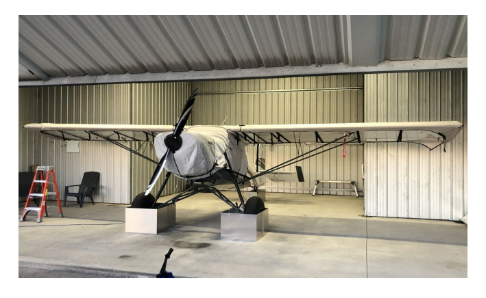
Just JA30 SuperSTOL Cover Set