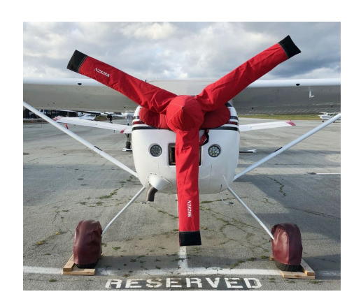
Cessna Skywagon Propellor/Spinner Cover, 3-blade type