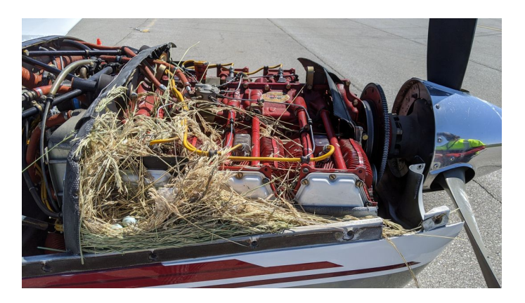
ENGINE PLUGS PREVENT BIRD NEST FOD. Piper Saratoga Engine Cowling Bird's Nest Preceptor STOL King Engine Plugs

Engine Inlet Plugs are custom fit for your Just Aircraft Highlander, Escapade, Super STOL intakes, made with heavy-duty vinyl material, and stuffed with a single block of sculpted urethane foam. Each plug has a zipper that allows the foam to be removed and dried if necessary. Engine plugs have warning flags that are visible from the cockpit or 'remove before flight' streamers sewn onto the face of the plugs. Most plugs are imprinted with the aircraft registration number in black for an extra charge. Storage bag NOT included. Engine plugs may be inserted after flight when the engine is still warm. Engine Inlet Plugs are commonly referred to as Cowl Plugs, Intake Plugs, Cowl Blocks, Engine Blocks, and Engine Bungs.