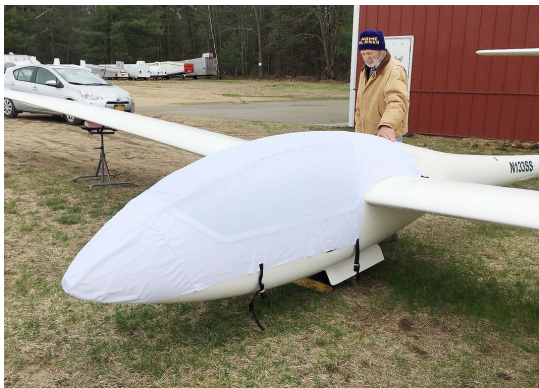
Grob 102 Astir CS Canopy/Nose Cover (test fit)