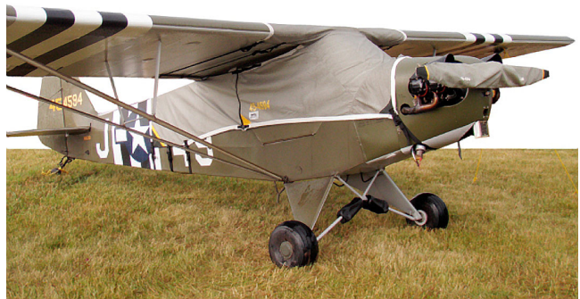
Piper J3 Extended Canopy Cover & Propellor Cover