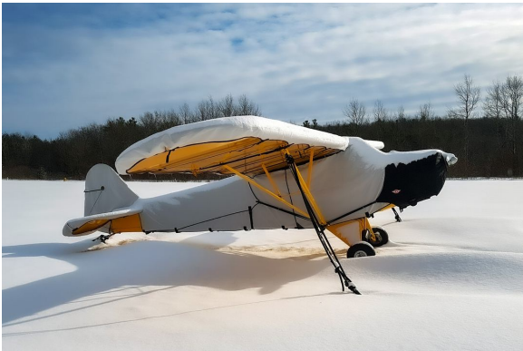
Piper J3 Cub Extended Canopy, Wings, Empennage & Insulated Engine Covers

WINTER USE MATERIAL - Made with Solution-Dyed Polyester fabric, this option is intended for seasonal use to aid in deicing, rain mitigation, or for occasional travel. The material is lighter and more compact, but more susceptible to UV damage and may have a shorter useful life if used continuously outside than the all-year use material.