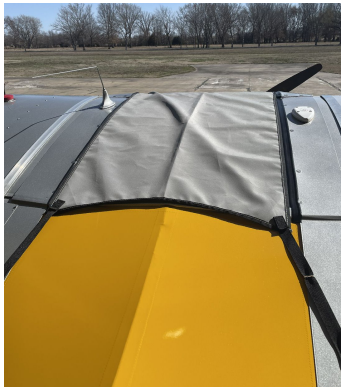
Piper PA-18 Windshield/Skylight Cover