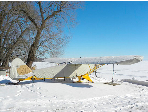
Piper J3 Cub Full Cover Set