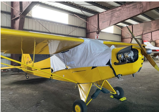
Piper J-3 Cub Canopy Cover

This cover type is made from Silver Acrylic Sunbrella canvas and is 100% lined with a soft and smooth microfiber. Bruce's Custom Covers developed this material combination especially for aircraft protection. The outer material is medium weight and treated for water resistance, UV resistance and anti-static buildup. The inner lining is a very soft and smooth microfiber to prevent scratching. The material is very reflective, and tests show that the cabin interior temperature can be reduced to near-ambient temperature on the hottest of days. It is water, ice and snow repellent, yet breathable to allow moisture to escape from between the cover and the aircraft surface.