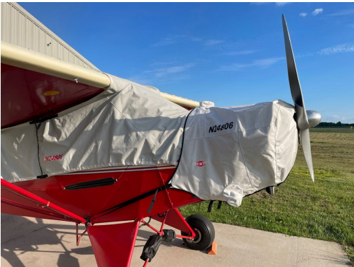
Legend Cub AL3 Insulated Engine Cover with special preheater access vent and attachment detail and fully enclosed under cowling. Piper J3 Cub Travel Weight Canopy & Engine Cover