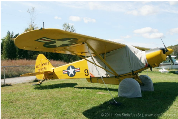
Piper L-21b Extended Canopy Cover, Tire Covers

ALL-YEAR USE MATERIAL - Made with Silver Acrylic Sunbrella canvas, the all-year use material is the best option for sun protection and cover longevity. This heavier more durable material is intended for all weather conditions, such as rain and snow or lots of sun.