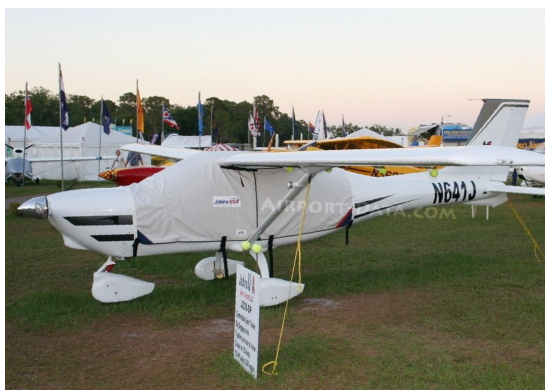
Jabiru J230 Canopy Cover