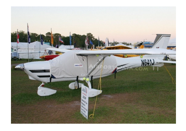
Jabiru J230 Canopy Cover

This cover type is made from Silver Acrylic Sunbrella canvas and is 100% lined with a soft and smooth microfiber. Bruce's Custom Covers developed this material combination especially for aircraft protection. The outer material is medium weight and treated for water resistance, UV resistance and anti-static buildup. The inner lining is a very soft and smooth microfiber to prevent scratching. The material is very reflective, and tests show that the cabin interior temperature can be reduced to near-ambient temperature on the hottest of days. It is water, ice and snow repellent, yet breathable to allow moisture to escape from between the cover and the aircraft surface.