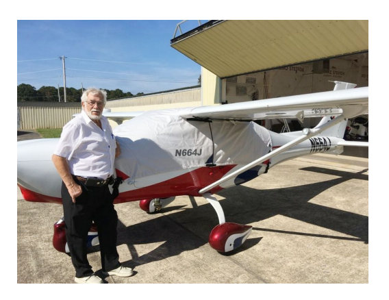
Jabiru 230SP Canopy Cover, Over-Top Style