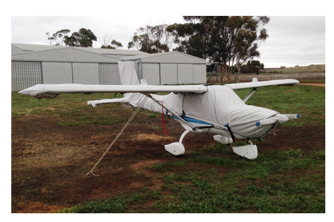
Jabiru 160 Canopy, Engine, Prop, Wings & Empennage Covers Jabiru 160 Canopy, Engine, Prop, Wings & Empennage Covers