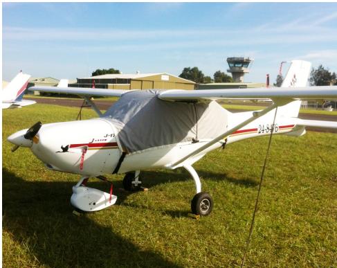
Jabiru 170 Canopy Cover

This cover type is made from Silver Acrylic Sunbrella canvas and is 100% lined with a soft and smooth microfiber. Bruce's Custom Covers developed this material combination especially for aircraft protection. The outer material is medium weight and treated for water resistance, UV resistance and anti-static buildup. The inner lining is a very soft and smooth microfiber to prevent scratching. The material is very reflective, and tests show that the cabin interior temperature can be reduced to near-ambient temperature on the hottest of days. It is water, ice and snow repellent, yet breathable to allow moisture to escape from between the cover and the aircraft surface.