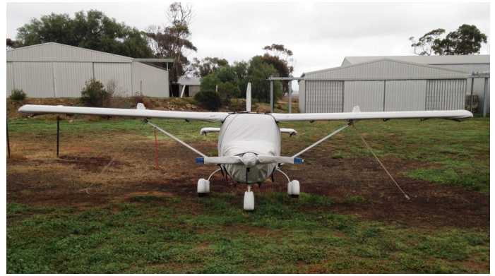
Jabiru 160 Canopy, Engine, Prop, Wings & Empennage Covers Jabiru 160 Canopy, Engine, Prop, Wings & Empennage Covers