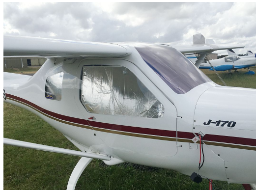
Jabiru 170 Heatshield Set

Heatshields are interior sunshades for an aircraft's windows or canopy glass. The product is a unique composite of closed-cell foam with a silver mylar finish. The semi-rigid design is stiff enough to stand along the inside of the windshield using sun visors or window framing. It folds up flat and easily stores in the included storage sleeve. Some designs may require velcro and suction cups. A Heatshield is an excellent short-term remedy for cockpit overheating.