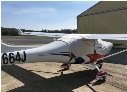
Jabiru J230-SP Canopy Cover, Over-Top Style