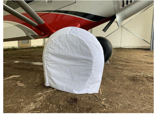
Piper PA-18 Super Cub Extended Canopy Cover, Wing & Tire Covers Cub Crafters CC19 Oversize Tire Covers, test fit cover