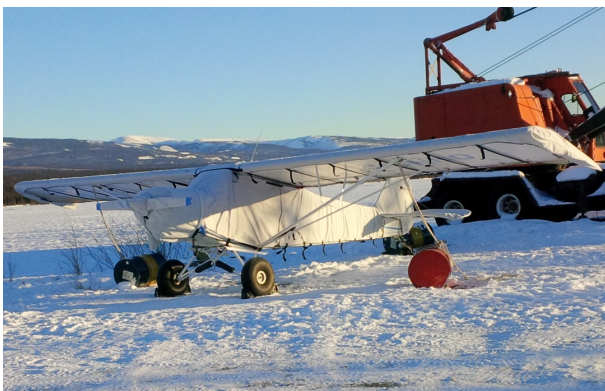
Piper Super Cub Complete Cover Set

WINTER USE MATERIAL - Made with Solution-Dyed Polyester fabric, this option is intended for seasonal use to aid in deicing, rain mitigation, or for occasional travel. The material is lighter and more compact, but more susceptible to UV damage and may have a shorter useful life if used continuously outside than the all-year use material.