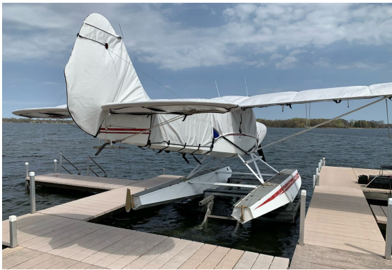
Aviat Husky Empennage Cover