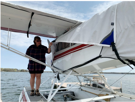
Aviat Husky Canopy, Wing, Empennage Covers