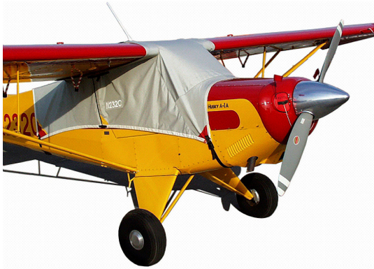
Aviat Husky Canopy Cover & Engine Plugs