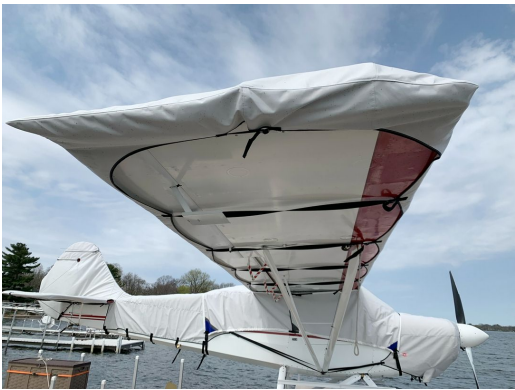
Aviat Husky Canopy, Engine, Wing, Empennage Covers

WINTER USE MATERIAL - Made with Solution-Dyed Polyester fabric, this option is intended for seasonal use to aid in deicing, rain mitigation, or for occasional travel. The material is lighter and more compact, but more susceptible to UV damage and may have a shorter useful life if used continuously outside than the all-year use material.