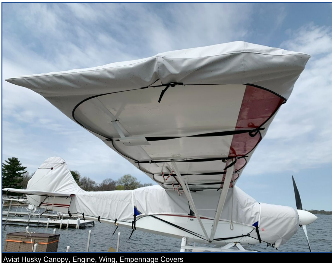
Aviat Husky Canopy, Engine, Wing, Empennage Covers