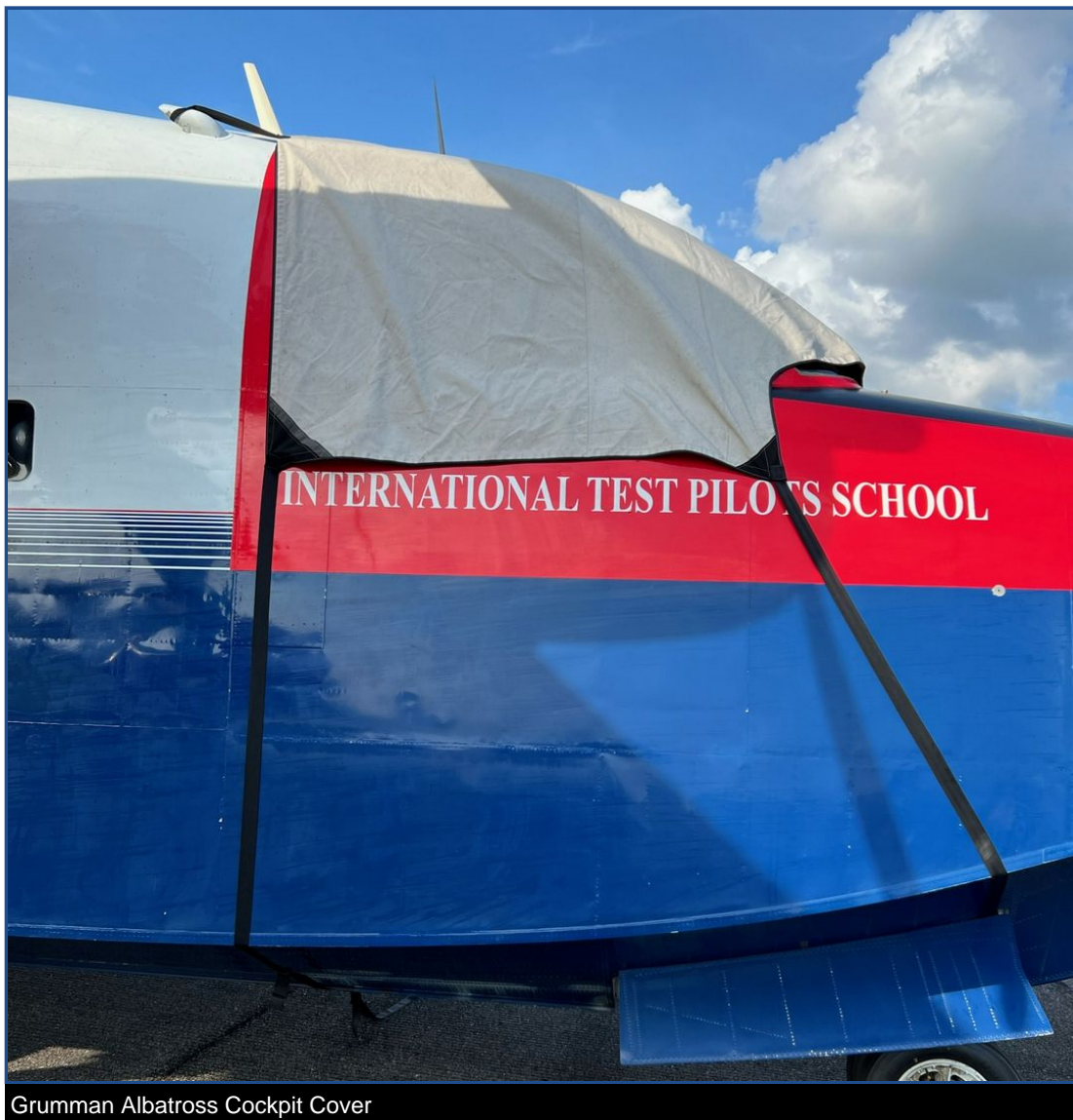
Grumman Albatross Cockpit Cover