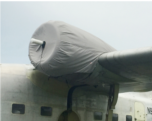
Grumman Albatross Engine Covers