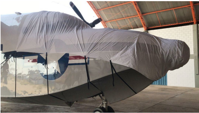
Grumman HU-16 Albatross Cockpit/Nose Cover (test fit cover)

This cover type is made from Silver Acrylic Sunbrella canvas and is 100% lined with a soft and smooth microfiber. Bruce's Custom Covers developed this material combination especially for aircraft protection. The outer material is medium weight and treated for water resistance, UV resistance and anti-static buildup. The inner lining is a very soft and smooth microfiber to prevent scratching. The material is very reflective, and tests show that the cabin interior temperature can be reduced to near-ambient temperature on the hottest of days. It is water, ice and snow repellent, yet breathable to allow moisture to escape from between the cover and the aircraft surface.