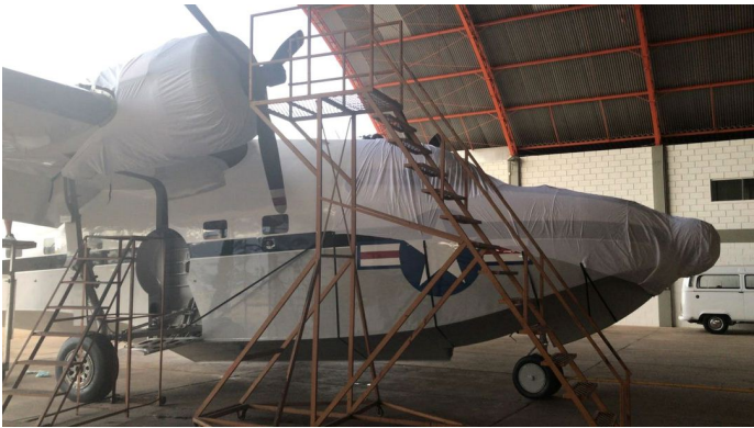
Grumman HU-16 Albatross Cockpit/Nose Cover and Engine Cover(test fit covers)