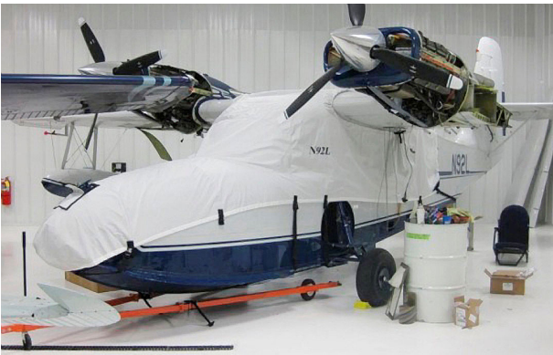
Grumman G44 Widgeon Canopy/Nose Cover