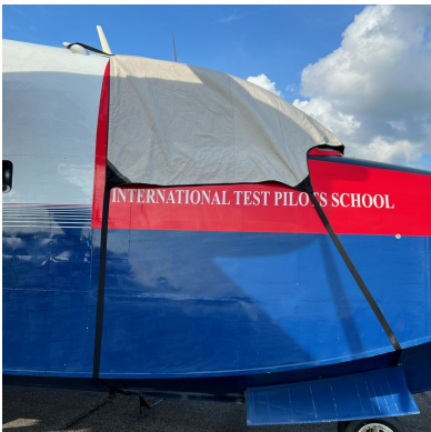
Grumman Albatross Cockpit Cover

This cover type is made from Silver Acrylic Sunbrella canvas and is 100% lined with a soft and smooth microfiber. Bruce's Custom Covers developed this material combination especially for aircraft protection. The outer material is medium weight and treated for water resistance, UV resistance and anti-static buildup. The inner lining is a very soft and smooth microfiber to prevent scratching. The material is very reflective, and tests show that the cabin interior temperature can be reduced to near-ambient temperature on the hottest of days. It is water, ice and snow repellent, yet breathable to allow moisture to escape from between the cover and the aircraft surface.