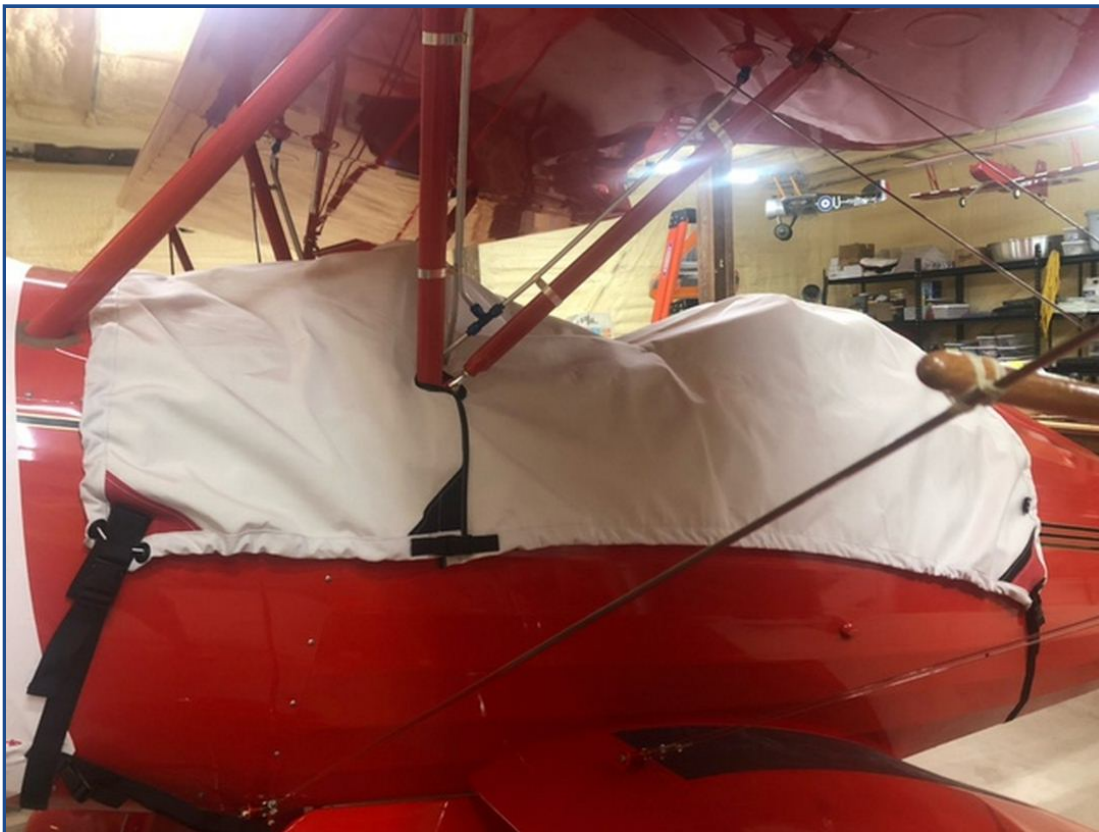
Hatz Biplane CB-1 Canopy Cover