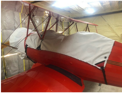
Hatz Biplane CB-1 Canopy Cover & Engine Cover