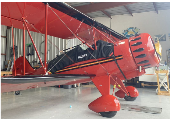
Biplane Hatz Classic Canopy Cover