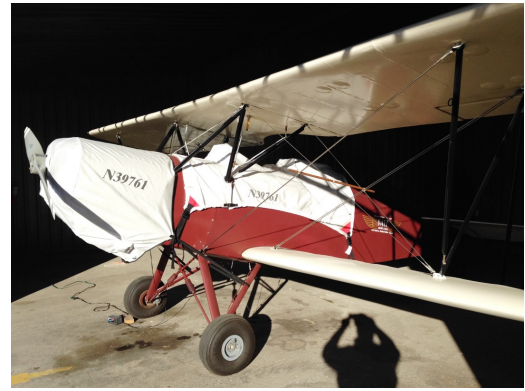
Hatz Biplane Canopy and Engine Covers