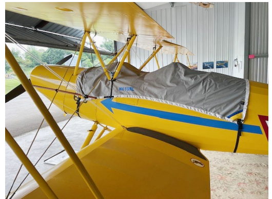
HATZ CB-1 Travel Cover, Light Weight Canopy Cover