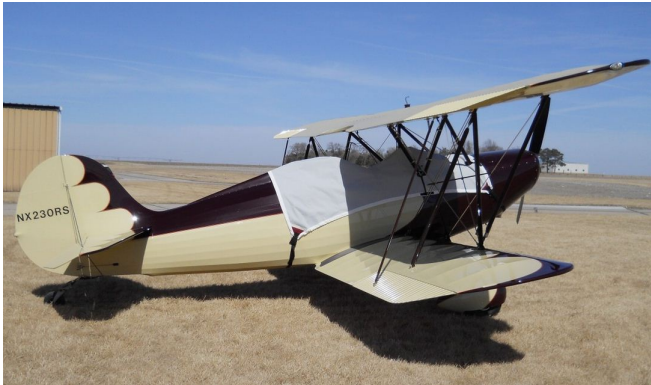
Hatz Biplane Canopy Cover