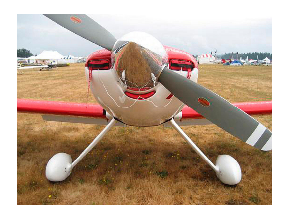
ENGINE PLUGS PREVENT BIRD NEST FOD. Piper Saratoga Engine Cowling Bird's Nest