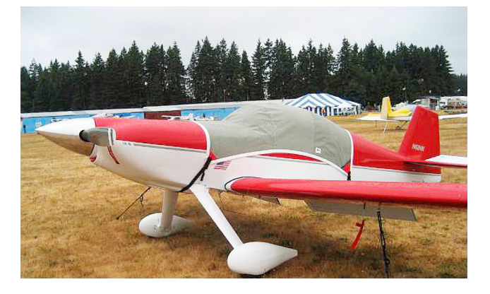
Harmon Rocket Canopy Cover & Engine Inlet Plugs

Travel Covers are made with Silver Solution-Dyed Polyester fabric and only lined over the windshield to save weight. The material is lightweight and more compact for easy stowage in the aircraft. The polyester material is water resistant, but only intended for occasional use outside. We also have an ultra lightweight material available for fitted hangar dust covers. For daily outdoor use, the non-travel Sunbrella Cover is the best choice.