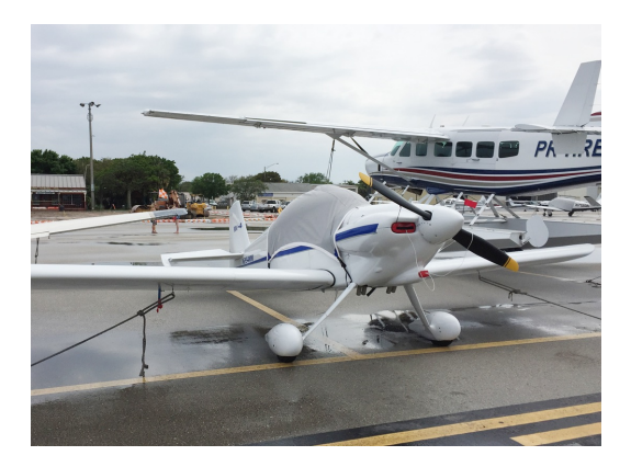
Harmon Rocket Canopy Cover