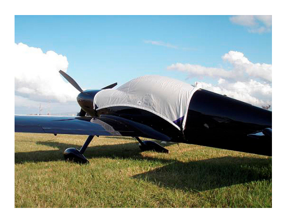
Harmon Rocket Canopy Cover