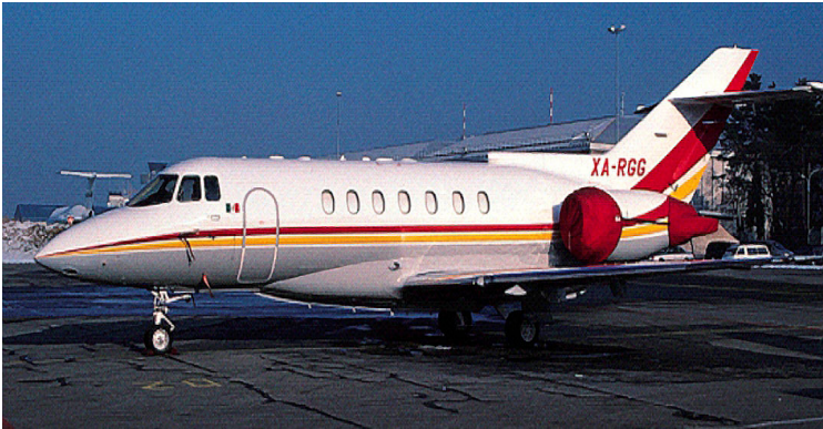
Hawker 1000 Engine Cover