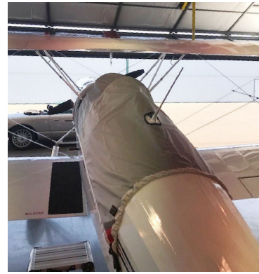
Great Lakes Sport Biplane Canopy Cover, Travel Weight