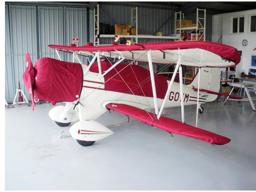
Waco UPF-7 Canopy, Wings, Stab's, Engine, Prop Covers