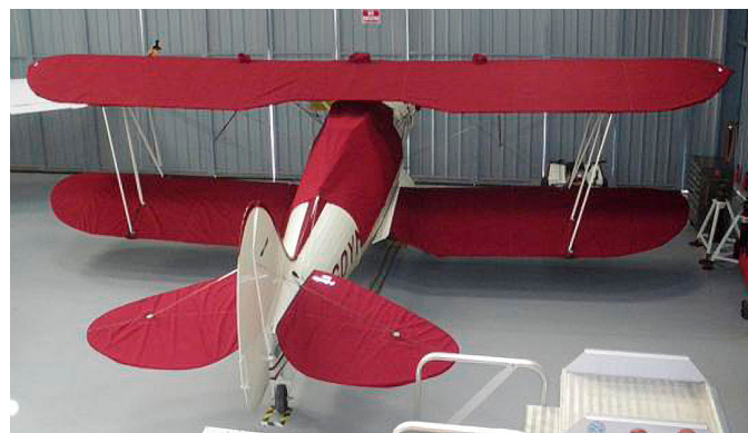
Waco UPF-7 Upper/Lower Wing Cover, Horizontal Stabilizer Cover, & Canopy Cover