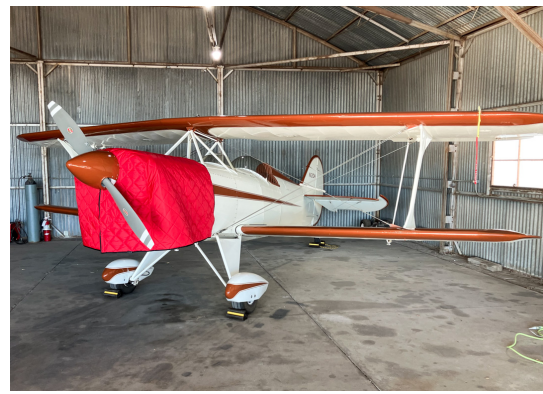
SKYBOLT, Insulated Hangar Blanket, Custom Fit Interior Use)