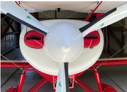
Great Lakes Engine Plugs

Engine Inlet Plugs are custom fit for your Great Lakes Sport Biplane intakes, made with heavy-duty vinyl material, and stuffed with a single block of sculpted urethane foam. Each plug has a zipper that allows the foam to be removed and dried if necessary. Engine plugs have warning flags that are visible from the cockpit or 'remove before flight' streamers sewn onto the face of the plugs. Most plugs are imprinted with the aircraft registration number in black for an extra charge. Storage bag NOT included. Engine plugs may be inserted after flight when the engine is still warm. Engine Inlet Plugs are commonly referred to as Cowl Plugs, Intake Plugs, Cowl Blocks, Engine Blocks, and Engine Bungs.