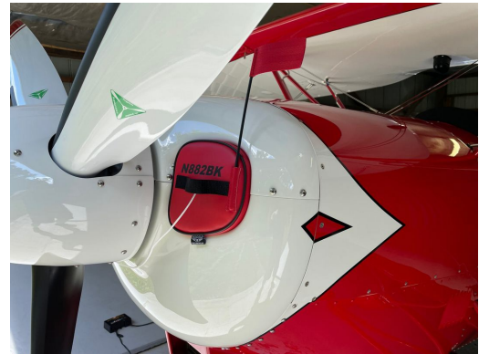
Great Lakes Engine Plugs