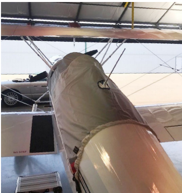
Great Lakes Sport Biplane Canopy Cover, Travel Weight

This cover type is made from Silver Acrylic Sunbrella canvas and is 100% lined with a soft and smooth microfiber. Bruce's Custom Covers developed this material combination especially for aircraft protection. The outer material is medium weight and treated for water resistance, UV resistance and anti-static buildup. The inner lining is a very soft and smooth microfiber to prevent scratching. The material is very reflective, and tests show that the cabin interior temperature can be reduced to near-ambient temperature on the hottest of days. It is water, ice and snow repellent, yet breathable to allow moisture to escape from between the cover and the aircraft surface.