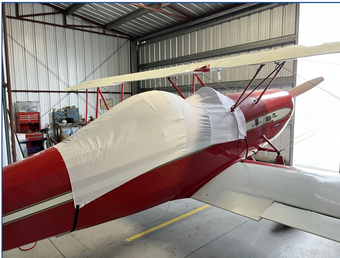
Great Lakes Sport Biplane Canopy Cover, test fit cover