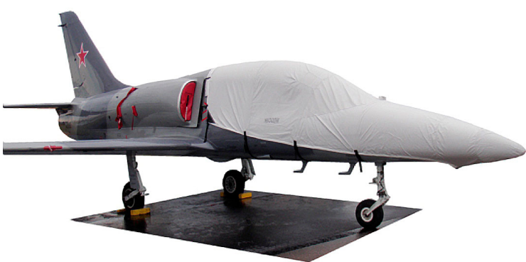
L-39 Canopy/Nose Cover & Plugs