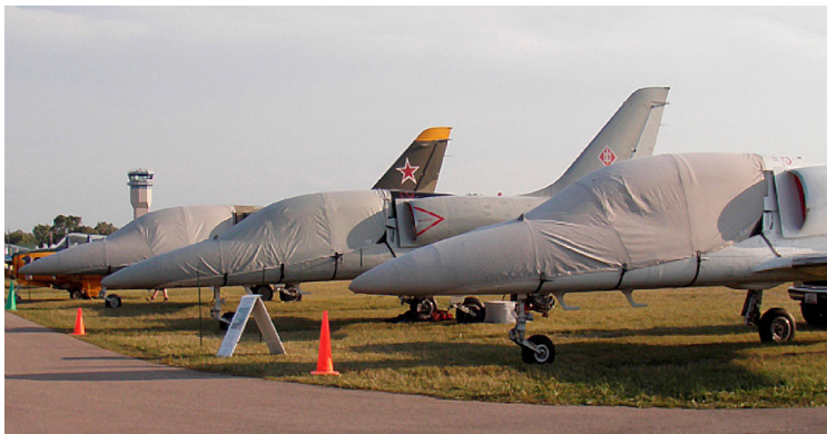
L-39 Canopy/Nose Covers & Plugs

Covers developed this material combination especially for aircraft protection. The outer material is medium weight and treated for water resistance, UV resistance and anti-static buildup. The inner lining is a very soft and smooth microfiber to prevent scratching. The material is very reflective, and tests show that the cabin interior temperature can be reduced to near-ambient temperature on the hottest of days. It is water, ice and snow repellent, yet breathable to allow moisture to escape from between the cover and the aircraft surface.