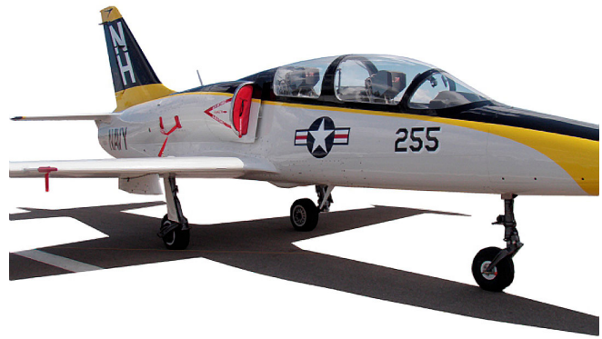
L-39 Intake Plugs