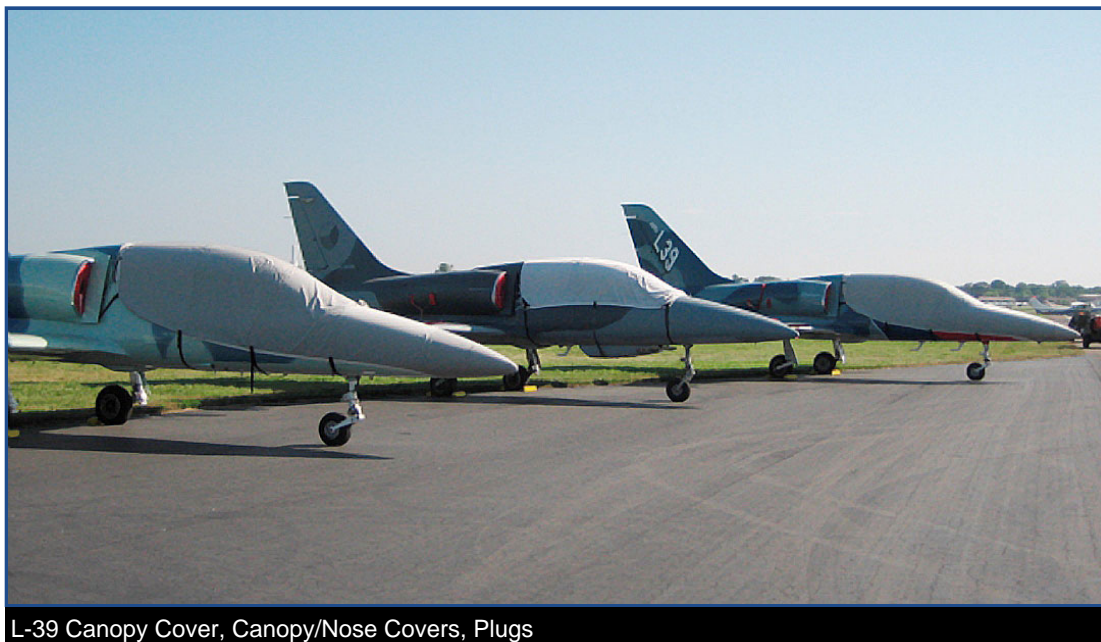
L-39 Canopy Cover, Canopy/Nose Covers, Plugs