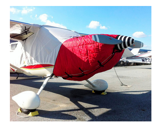
Glastar Insulated Engine Cover

This cover type is made from Silver Acrylic Sunbrella canvas and is 100% lined with a soft and smooth microfiber. Bruce's Custom Covers developed this material combination especially for aircraft protection. The outer material is medium weight and treated for water resistance, UV resistance and anti-static buildup. The inner lining is a very soft and smooth microfiber to prevent scratching. The material is very reflective, and tests show that the cabin interior temperature can be reduced to near-ambient temperature on the hottest of days. It is water, ice and snow repellent, yet breathable to allow moisture to escape from between the cover and the aircraft surface.