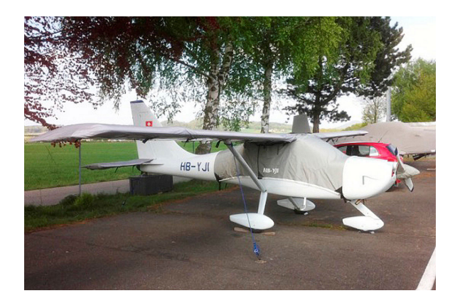
OMF Symphony Canopy, Wings, Horiz. Stab, and Prop Covers