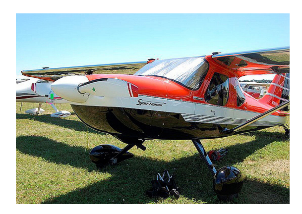
Glastar Sportsman Windshield HeatShield

Windshield Heatshields are interior sunshades for an aircraft's front windshield. The product is a unique composite of closed-cell foam with a silver mylar finish. The semi-rigid design is stiff enough to stand along the inside of the windshield using sun visors or window framing. It folds up flat and easily stores in the included storage sleeve. Some designs may require velcro and suction cups or split right and left sides. A Heatshield is an excellent short-term remedy for cockpit overheating. An external fabric cover is far more effective and practical for long-term protection.