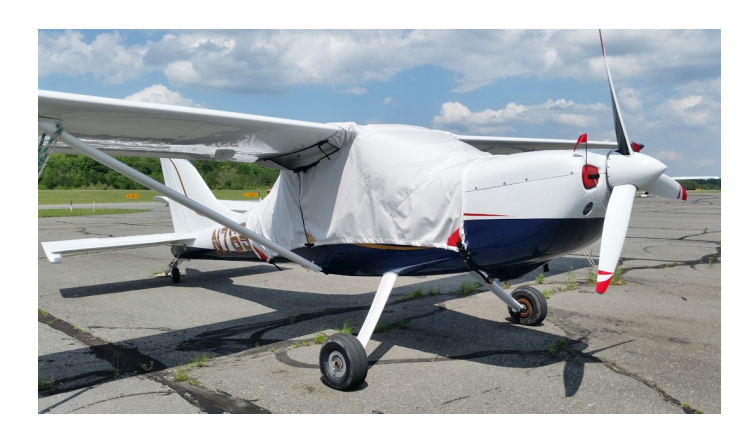
Glastar Over-Top Canopy Cover, Engine Plugs