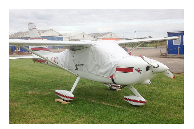
Glastar Over-Top Canopy Cover