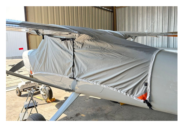
Glasair Aviation Glastar, Sportsman 2+2 Travel Cover, Light Weight Canopy Cover