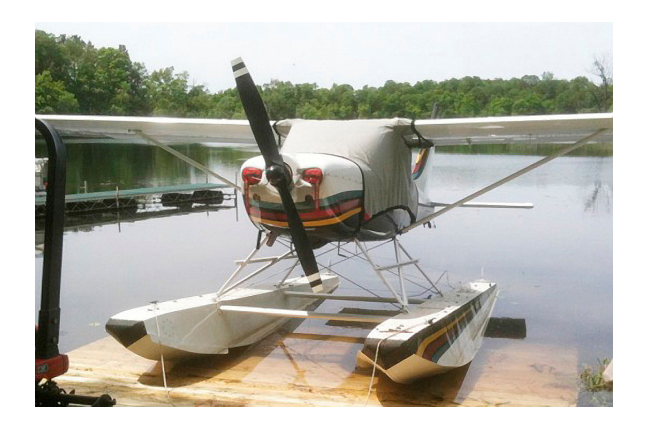
Glastar Sportsman Canopy Cover and Engine Plugs