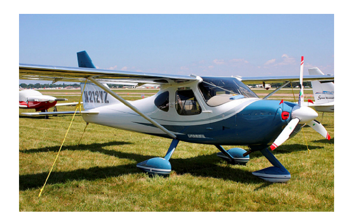
Glastar Sportsman Engine Inlet Plugs

Engine Inlet Plugs are custom fit for your Glasair Aviation Glastar, Sportsman 2+2 intakes, made with heavy-duty vinyl material, and stuffed with a single block of sculpted urethane foam. Each plug has a zipper that allows the foam to be removed and dried if necessary. Engine plugs have warning flags that are visible from the cockpit or 'remove before flight' streamers sewn onto the face of the plugs. Most plugs are imprinted with the aircraft registration number in black for an extra charge. Storage bag NOT included. Engine plugs may be inserted after flight when the engine is still warm. Engine Inlet Plugs are commonly referred to as Cowl Plugs, Intake Plugs, Cowl Blocks, Engine Blocks, and Engine Bungs.