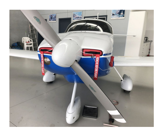
Glasair 2 Engine Inlet Plugs