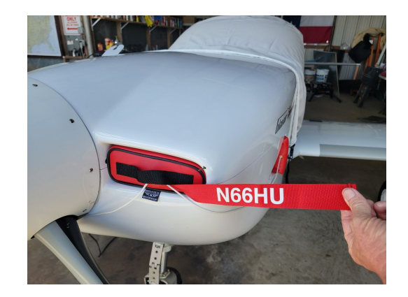
GLASAIR S2-RG Canopy Cover, Engine Plugs

This cover type is made from Silver Acrylic Sunbrella canvas and is 100% lined with a soft and smooth microfiber. Bruce's Custom Covers developed this material combination especially for aircraft protection. The outer material is medium weight and treated for water resistance, UV resistance and anti-static buildup. The inner lining is a very soft and smooth microfiber to prevent scratching. The material is very reflective, and tests show that the cabin interior temperature can be reduced to near-ambient temperature on the hottest of days. It is water, ice and snow repellent, yet breathable to allow moisture to escape from between the cover and the aircraft surface.