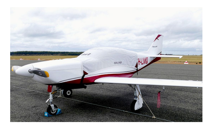
Glasair Aviation Glasair III Canopy Cover