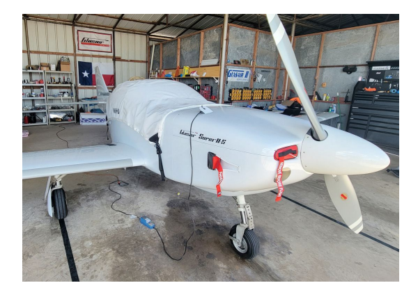
GLASAIR S2-RG Canopy Cover, Engine Plugs

Engine Inlet Plugs are custom fit for your Glasair Aviation Glasair II & III intakes, made with heavy-duty vinyl material, and stuffed with a single block of sculpted urethane foam. Each plug has a zipper that allows the foam to be removed and dried if necessary. Engine plugs have warning flags that are visible from the cockpit or 'remove before flight' streamers sewn onto the face of the plugs. Most plugs are imprinted with the aircraft registration number in black for an extra charge. Storage bag NOT included. Engine plugs may be inserted after flight when the engine is still warm. Engine Inlet Plugs are commonly referred to as Cowl Plugs, Intake Plugs, Cowl Blocks, Engine Blocks, and Engine Bungs.