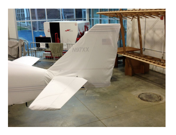
Glasair Aviation Glasair I Complete Fuselage Cover W/Detachable Wing Covers