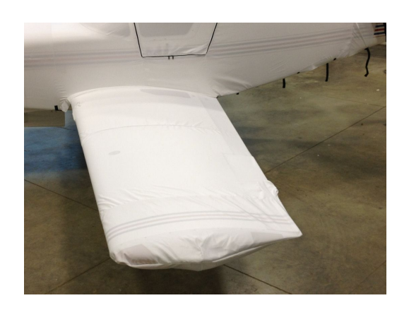
Glasair Aviation Glasair I Complete Fuselage Cover W/Detachable Wing Covers

This cover type is made from Silver Acrylic Sunbrella canvas and is 100% lined with a soft and smooth microfiber. Bruce's Custom Covers developed this material combination especially for aircraft protection. The outer material is medium weight and treated for water resistance, UV resistance and anti-static buildup. The inner lining is a very soft and smooth microfiber to prevent scratching. The material is very reflective, and tests show that the cabin interior temperature can be reduced to near-ambient temperature on the hottest of days. It is water, ice and snow repellent, yet breathable to allow moisture to escape from between the cover and the aircraft surface.