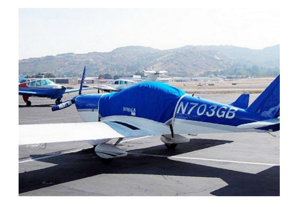
Gobosh 700S Canopy Cover (comes in colors)

This cover type is made from Silver Acrylic Sunbrella canvas and is 100% lined with a soft and smooth microfiber. Bruce's Custom Covers developed this material combination especially for aircraft protection. The outer material is medium weight and treated for water resistance, UV resistance and anti-static buildup. The inner lining is a very soft and smooth microfiber to prevent scratching. The material is very reflective, and tests show that the cabin interior temperature can be reduced to near-ambient temperature on the hottest of days. It is water, ice and snow repellent, yet breathable to allow moisture to escape from between the cover and the aircraft surface.