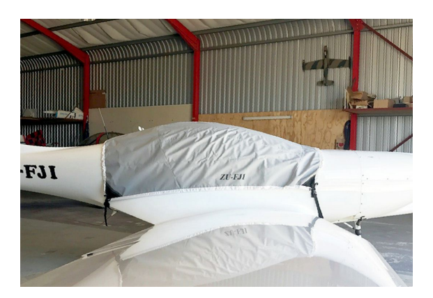
Gobosh 800XP Travel Cover, Light Weight Travel Canopy Cover and Gobosh 800XP Travel Cover, Light Weight Travel Canopy Cover Cover