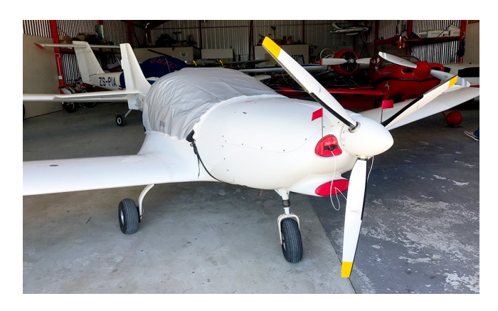
Gobosh 800XP Travel Cover, Light Weight Travel Canopy Cover and Inlet Plugs

Engine Inlet Plugs are custom fit for your Gobosh 800XP intakes, made with heavy-duty vinyl material, and stuffed with a single block of sculpted urethane foam. Each plug has a zipper that allows the foam to be removed and dried if necessary. Engine plugs have warning flags that are visible from the cockpit or 'remove before flight' streamers sewn onto the face of the plugs. Most plugs are imprinted with the aircraft registration number in black for an extra charge. Storage bag NOT included. Engine plugs may be inserted after flight when the engine is still warm. Engine Inlet Plugs are commonly referred to as Cowl Plugs, Intake Plugs, Cowl Blocks, Engine Blocks, and Engine Bungs.