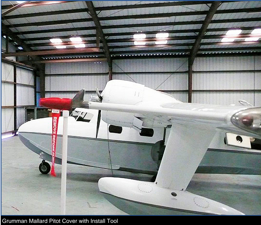
Grumman Mallard Pitot Cover with Install Tool