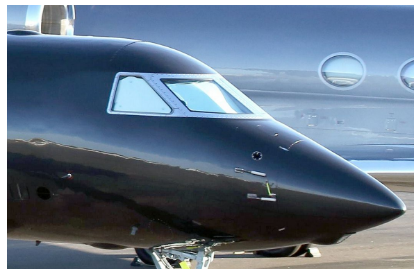
Gulfstream Cockpit Heatshields