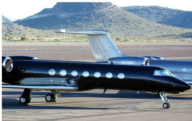
Gulfstream Cockpit Heatshields

Cockpit Heatshields are interior sunshades for the aircraft's cockpit. The product is a unique composite of closed-cell foam with a silver mylar finish. The semi-rigid design is stiff enough to stand inside the window framing. The set folds up flat and is easily stored in the included storage sleeve. Some designs may require velcro and suction cups. Our Heatshields for jets are offered white side out because some aircraft manufacturers have issued advisories against reflective window inserts due to potential heat damage. A Heatshield is an excellent short-term remedy for cockpit overheating, but an external fabric cover is more effective for long-term protection.