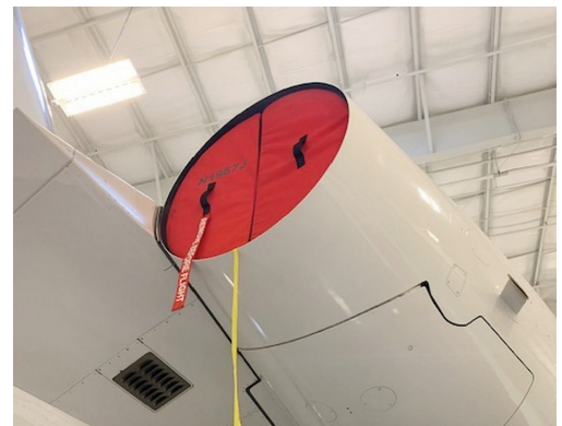
Grumman Gulfstream G-V Exhaust Plugs