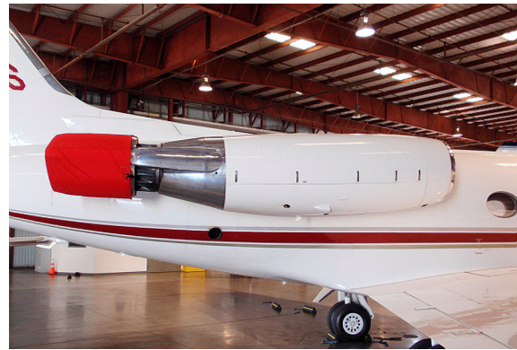
Stage III Quiet Technologies Hush Kit Cover