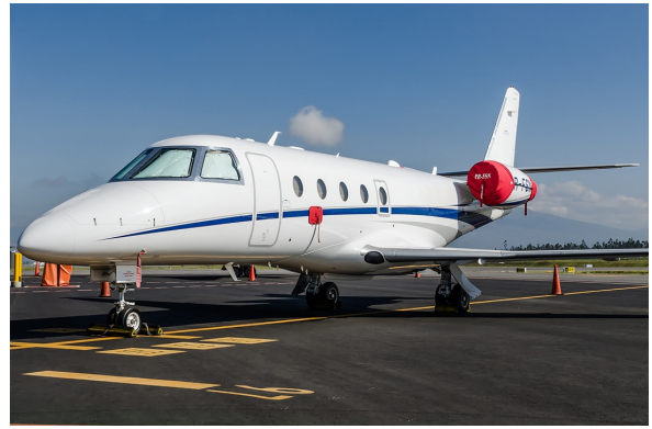
Gulfstream G150 Engine Covers, Cockpit HeatShields