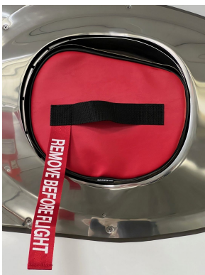
Gulfstream V APU Exhaust Plug

The Engine Inlet Plugs are custom fit for your Gulfstream Aerospace Gulfstream G150 intakes, made with heavy-duty vinyl material, and stuffed with a single block of sculpted urethane foam. Each plug has a zipper that allows the foam to be removed and dried if necessary. Engine plugs have 'remove before flight' streamers sewn onto the face of the plugs. Most plugs are imprinted with the aircraft registration number in black for an extra charge. Storage bag NOT included. Engine plugs may be inserted after flight when the engine is still warm. Engine Inlet Plugs are commonly referred to as Cowl Plugs, Intake Plugs, Cowl Blocks, Engine Blocks, and Engine Bungs.