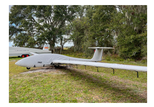
Burkhart Grob G 103 TWIN II Complete Cover Set