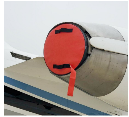
Gulfstream G100 Exhaust Plugs