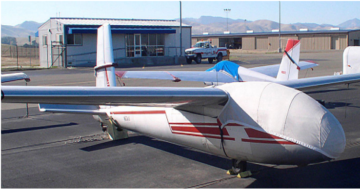
Blanik L13 Canopy/Nose Cover

the hottest of days. It is water, ice and snow repellent, yet breathable to allow moisture to escape from between the cover and the aircraft surface.