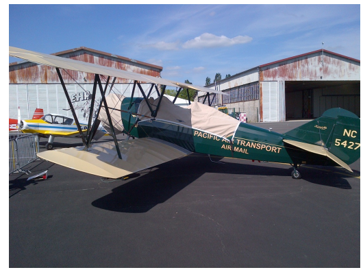
Travelair 4000 Canopy and Engine Cover