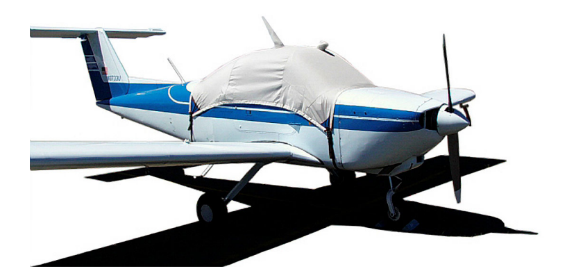
Canopy Cover for Beech Skipper