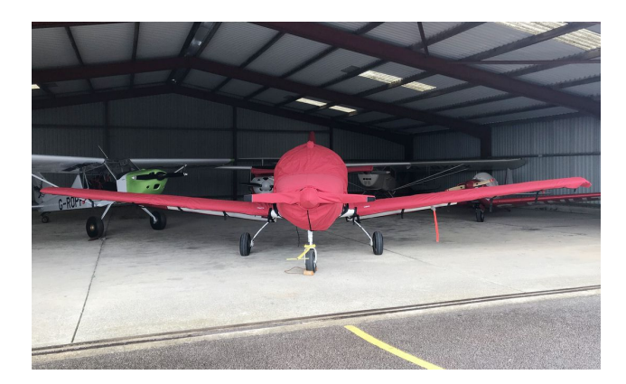
FLS Club Sprint Empennage Cover (Tailboom, Vertical & Horiz Stabilizers) All Year Use

WINTER USE MATERIAL - Made with Solution-Dyed Polyester fabric, this option is intended for seasonal use to aid in deicing, rain mitigation, or for occasional travel. The material is lighter and more compact, but more susceptible to UV damage and may have a shorter useful life if used continuously outside than the all-year use material.