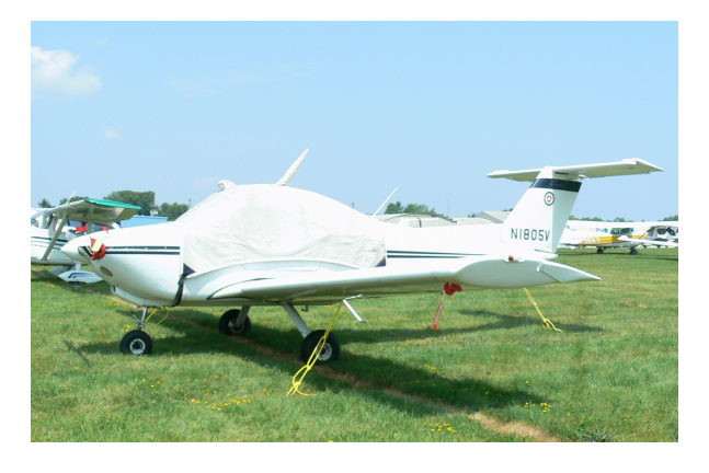
Beech Skipper Canopy Cover, Engine Plugs

Covers developed this material combination especially for aircraft protection. The outer material is medium weight and treated for water resistance, UV resistance and anti-static buildup. The inner lining is a very soft and smooth microfiber to prevent scratching. The material is very reflective, and tests show that the cabin interior temperature can be reduced to near-ambient temperature on the hottest of days. It is water, ice and snow repellent, yet breathable to allow moisture to escape from between the cover and the aircraft surface.