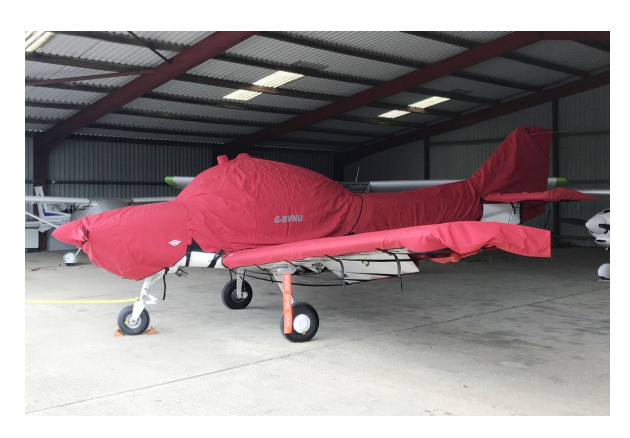
FLS Club Sprint Engine Cover