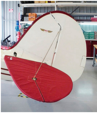
Waco UPF-7 Horizontal Stab. Cover