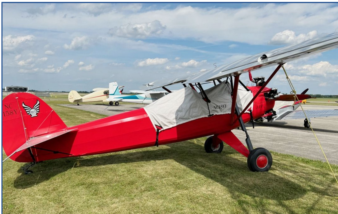
Davis D-1K Canopy Cover