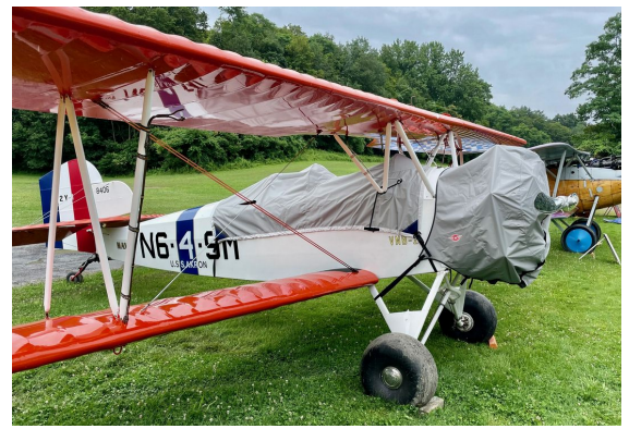
Fleet Biplane Model 1 Canopy & Engine Covers