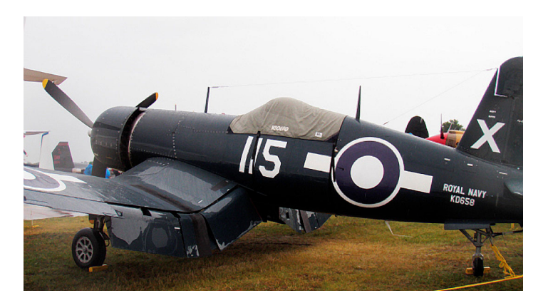
F4U Canopy Cover