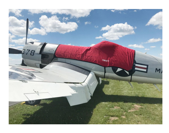
Chance-Vought F4U-7 Canopy Cover