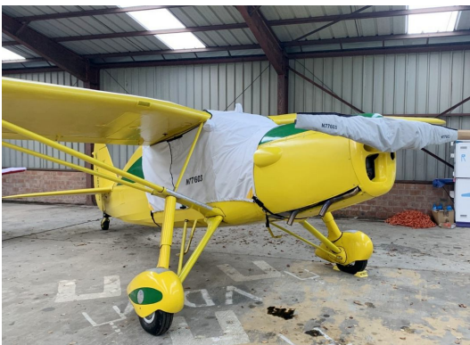
Fairchild 24 Over-Top Canopy Cover

Travel Covers are made with Silver Solution-Dyed Polyester fabric and only lined over the windshield to save weight. The material is lightweight and more compact for easy stowage in the aircraft. The polyester material is water resistant, but only intended for occasional use outside. We also have an ultra lightweight material available for fitted hangar dust covers. For daily outdoor use, the non-travel Sunbrella Cover is the best choice.