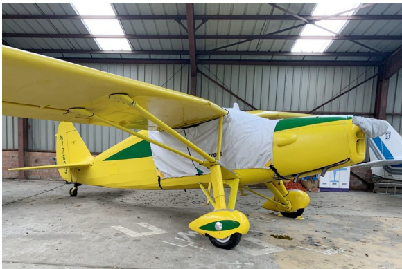
Fairchild 24 Over-Top Canopy Cover, Prop Cover