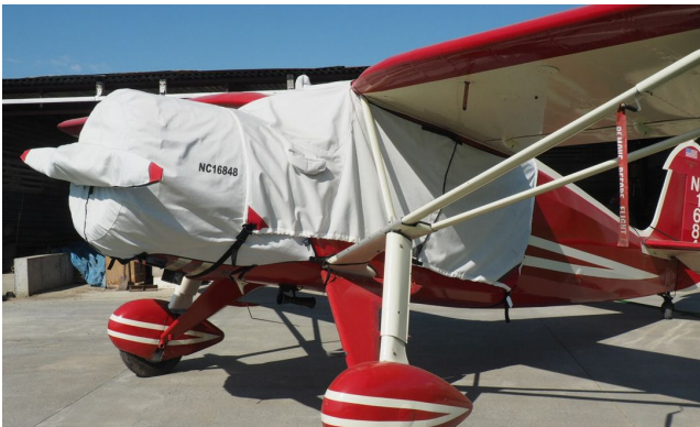
Fairchild 24W Canopy, Engine & Prop Cover

This cover type is made from Silver Acrylic Sunbrella canvas and is 100% lined with a soft and smooth microfiber. Bruce's Custom Covers developed this material combination especially for aircraft protection. The outer material is medium weight and treated for water resistance, UV resistance and anti-static buildup. The inner lining is a very soft and smooth microfiber to prevent scratching. The material is very reflective, and tests show that the cabin interior temperature can be reduced to near-ambient temperature on the hottest of days. It is water, ice and snow repellent, yet breathable to allow moisture to escape from between the cover and the aircraft surface.