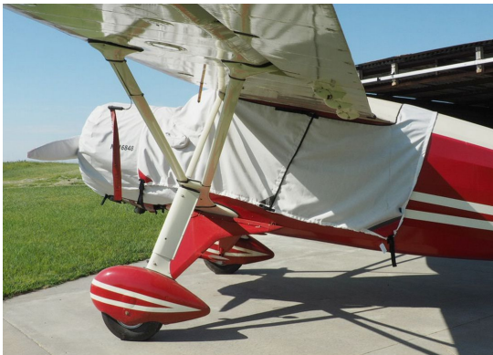
Fairchild 24W Canopy & Engine Cover

This cover type is made from Silver Acrylic Sunbrella canvas and is 100% lined with a soft and smooth microfiber. Bruce's Custom Covers developed this material combination especially for aircraft protection. The outer material is medium weight and treated for water resistance, UV resistance and anti-static buildup. The inner lining is a very soft and smooth microfiber to prevent scratching. The material is very reflective, and tests show that the cabin interior temperature can be reduced to near-ambient temperature on the hottest of days. It is water, ice and snow repellent, yet breathable to allow moisture to escape from between the cover and the aircraft surface.